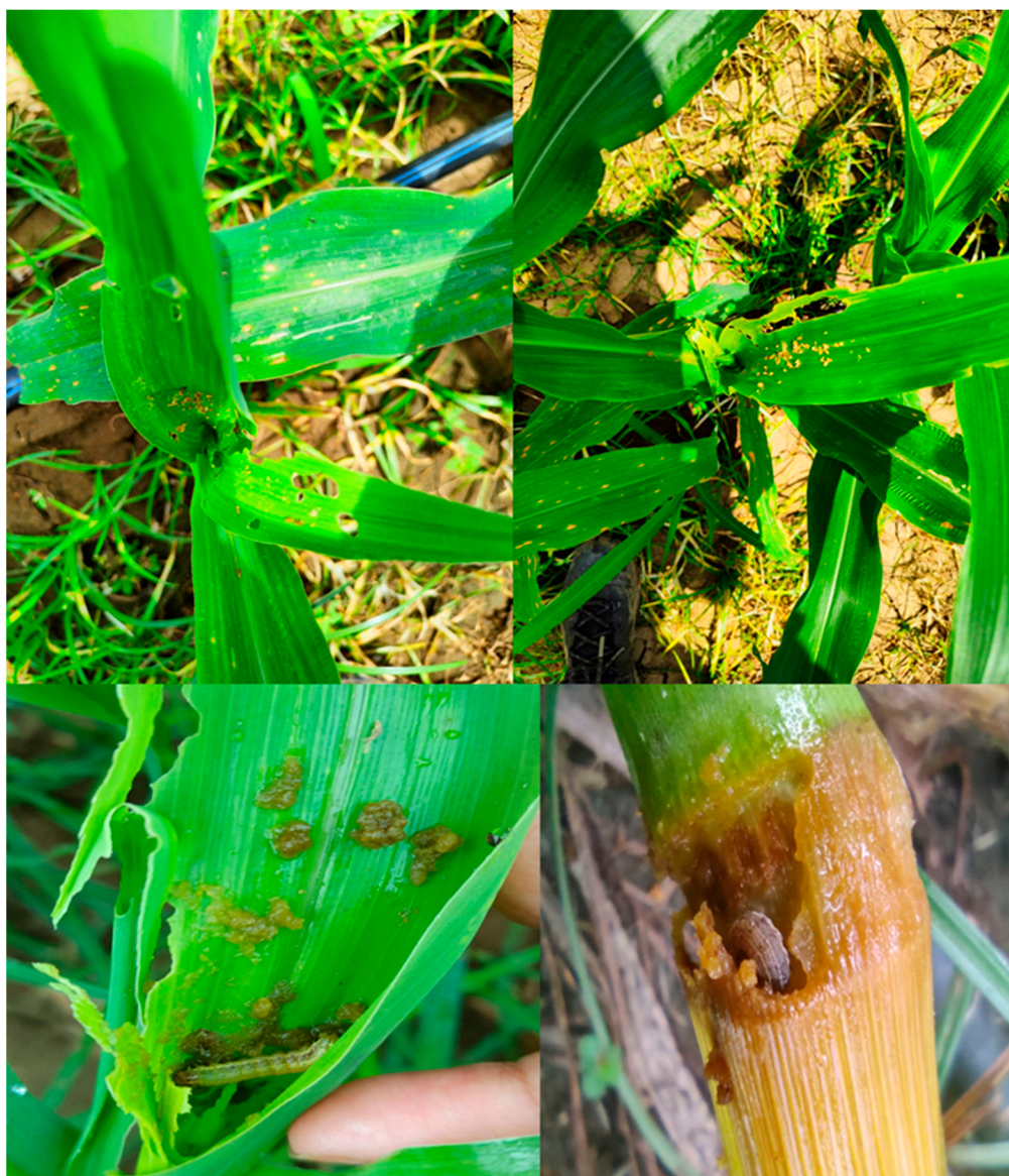
Figure S5. Damage by Spodoptera frugiperda .