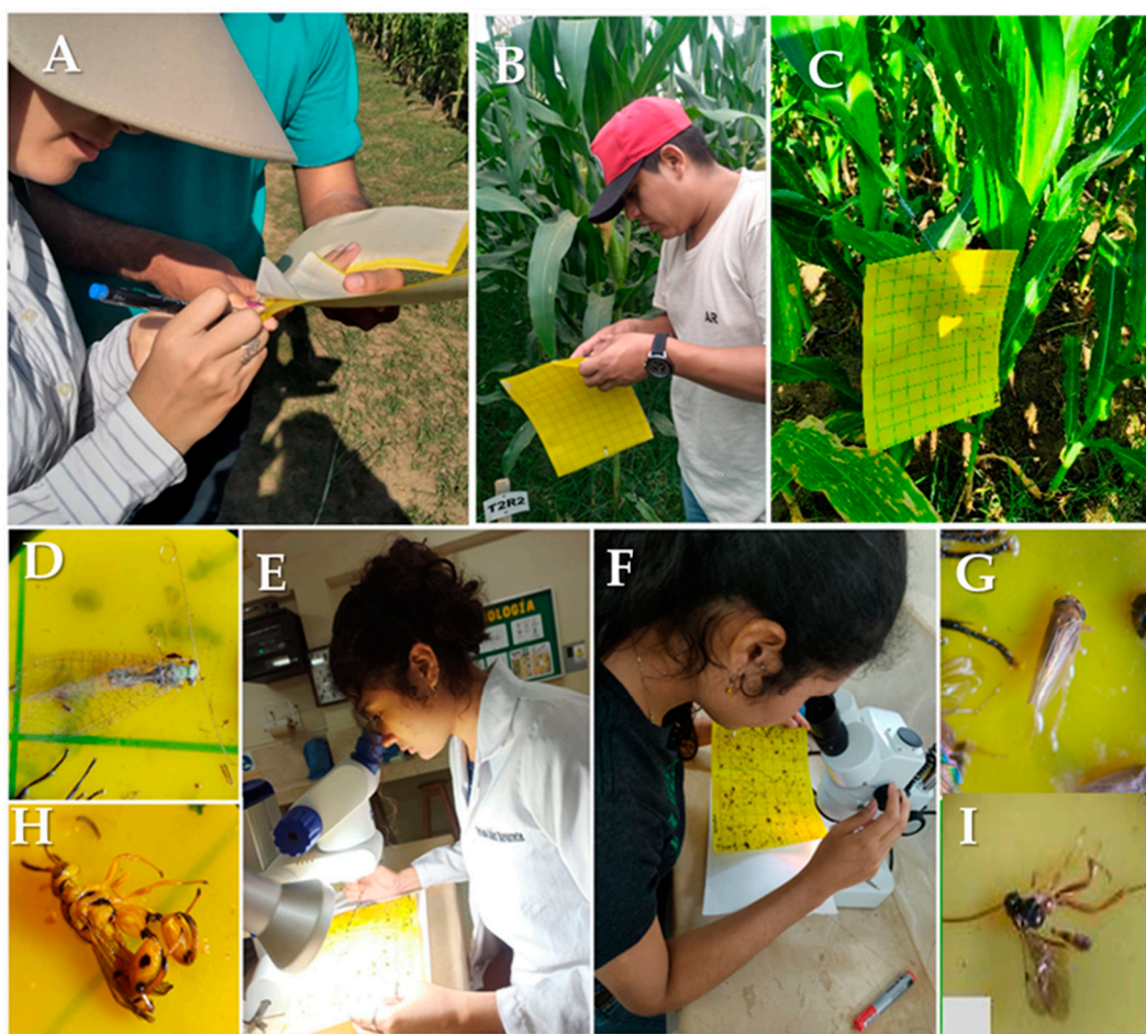
Figure S4. (A-C) Placement and (D-I) review of yellow traps.