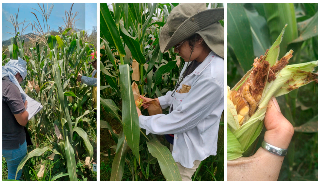
Figure S7. Evaluation of damage by earworm, Heliothis zea .