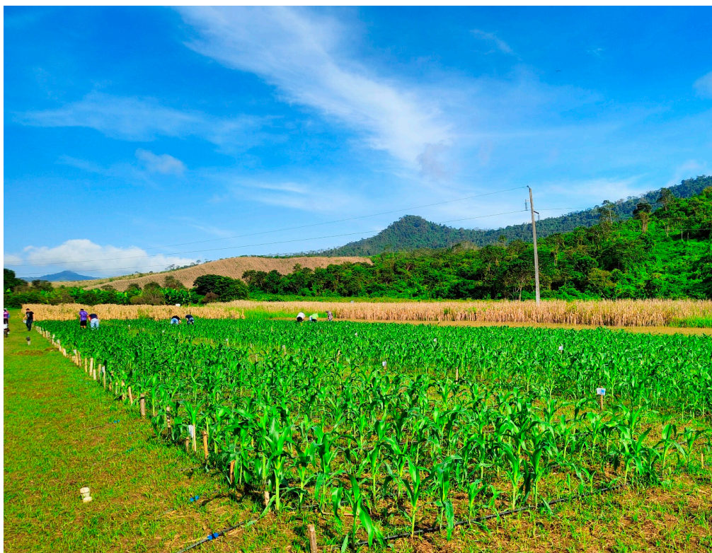
Figure S2. Corn plot showing the surrounding areas.