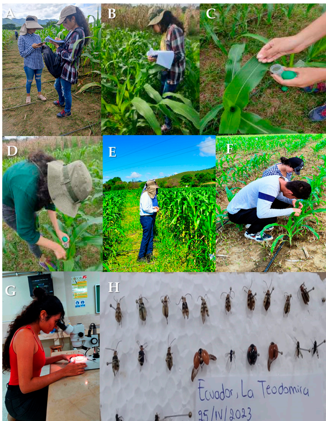
Figure S3. (A-F) Field observations and collection of insects associated with corn, (G-H) Laboratory observations and preservation of insects.