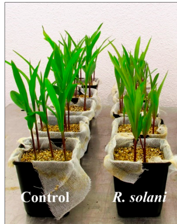
Figure S2. Maize seedlings germinated in non-inoculated potting substrate and placed five days after planting on non-inoculated potting substrate (control; left ) or on potting substrate inoculated with Rhizoctonia solani ( right ).