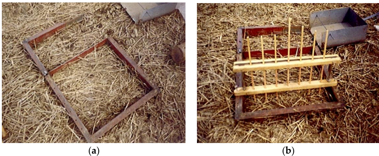
Figure 1. Steel frames, pressed to the soil (a); the measurement of seedbed surface roughness using a K. Trečiokas profilometer (b). The profilometer has seven rulers that measure the distance from the frame and seedbed surface. The measurements were performed at seven frame spots, resulting in a total of 49 seedbed surface measurements. These data were used for evaluation of seedbed surface and bottom roughness and sowing depth.

(5) The excavated soil was sieved and the fractions of soil aggregates <2 mm, 2–5 mm and >5 mm in diameter were separated (Figure 2b). Their percentage composition was determined by pouring the individual fractions into a measuring cylinder (approximately 2 L capacity). Knowing the total volume of the fractions of the excavated seedbed layer aggregates, the aggregate percentages for the seedbed were calculated [26]. The most important is the percentage of agronomically valuable aggregates of 2–5 mm in diameter [27] and stratification of soil aggregates by size [28].