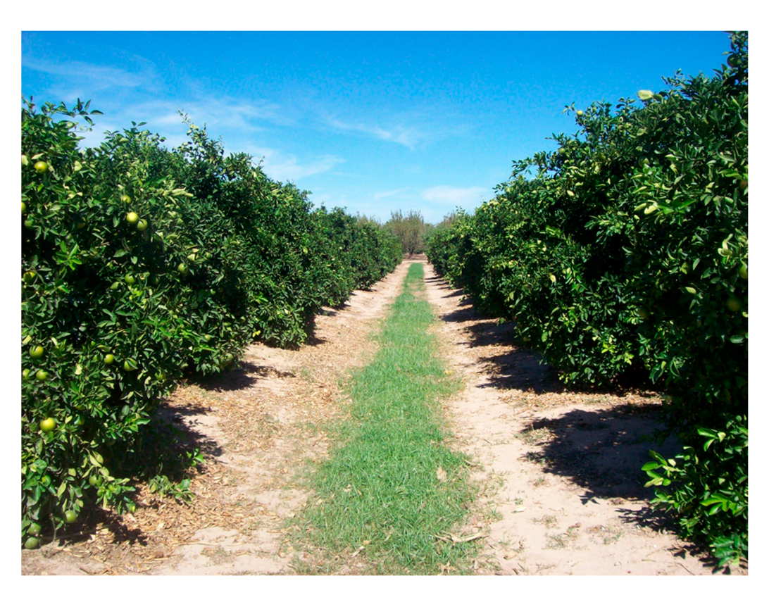
Figure 1. Overview of the experimental plot.

Standard cultural practices were applied, with regard to drip irrigation, and were hand-pruned annually after harvest. Irrigation was applied by two drip-lines in each tree row, with 2.2 L h^{-1} of drippers every 60 cm. Seasonal water requirements were calculated based on the reference evapotranspiration (ET<sub>0</sub>) and citrus crop coefficient (K<sub>c</sub>) [23].