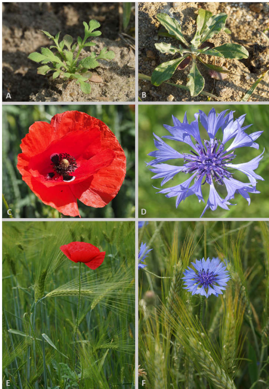
Figure 1. Leaf rosette of corn poppy (A) and cornflower (B). Flower of corn poppy (C) and inflorescence of cornflower (D). Corn poppy (E) and cornflower (F) blooming in the winter cereals.

Both corn poppy and cornflower are strong competitors with crops [2,3,34,45,46]. The presence of corn poppy or cornflower in a canopy can reduce the winter wheat yield by 12–37% [45–47]. Cornflower is also more competitive than other weed species in a multi-species canopy [48]. In recent decades, there have been clear disparities in the frequencies of corn poppy and cornflower on Europe’s agricultural landscape. Corn poppy is widespread throughout Europe, whereas cornflower is becoming increasingly rare (Figure 2). This change in status may be associated with the genotypic and phenotypic diversity of each of these weeds, correlated with, among other things, a pollination pattern. Both corn poppy and cornflower are insect pollinated. However, corn poppy is highly