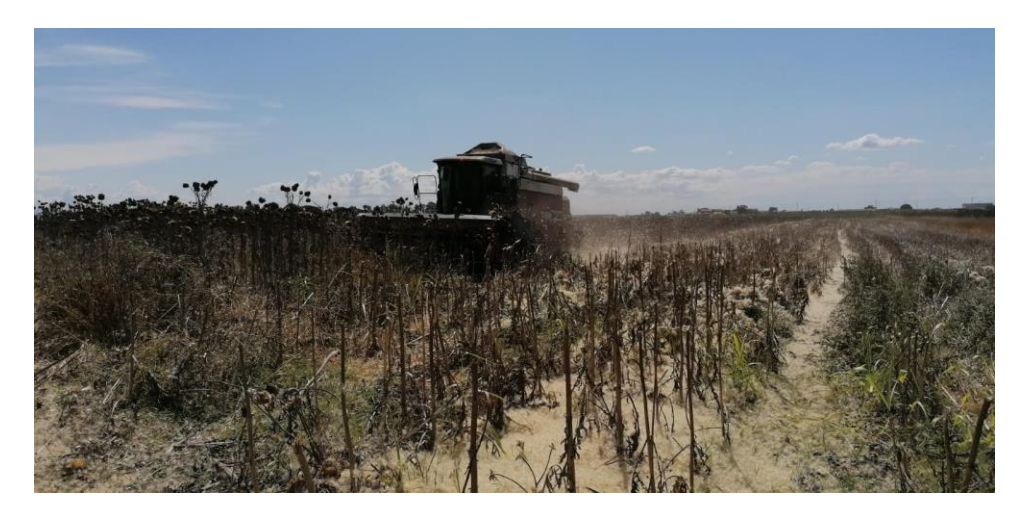
Figure 2. FiatAgri L624 combine harvester at work.

A local contractor enterprise provided the combine harvester, a FiatAgri L624 (Figure 2) equipped with a conventional cleaning shoe and a 4.8 m wide Laverda C480 header, modified with a Zaffrani sunflower kit [33]. The machine was driven by a 176 kW diesel engine. The applied setting, which was kept constant throughout the test, was as follows: Concave clearance of 23.7 mm, thresher speed of 800 rpm, fan speed of 420 rpm, upper sieve clearance of 5 mm, and lower sieve clearance of 4 mm.