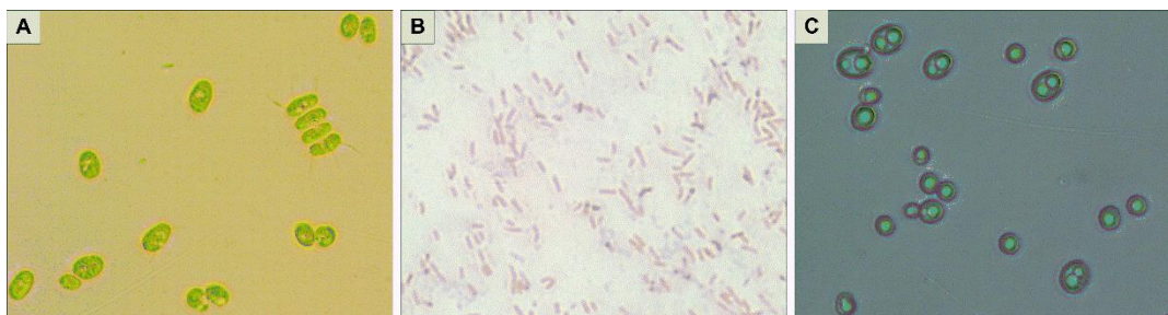
Figure S3. Microscopic images of test organisms used in the research: (A) microalgae Scenedesmus sp. (magnification 400×), (B) bacteria Pseudomonas putida (magnification 1000×), and (C) yeast Saccharomyces cerevisiae (magnification 400×).