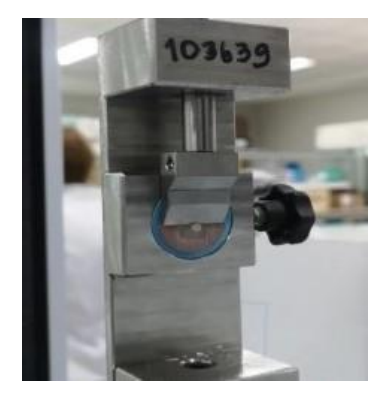
Figure 1. Test setup for shear bond strength.

A universal testing device (AGS-X 500N, Shimadzu Corporation, Kyoto, Japan) was used to evaluate the shear bond strength of the specimens. The shearing blade was positioned parallel to the intersection of the zirconia and resin composite. A shear pressure of 0.5 mm per min was set until fracture occurred (Figure 1). The shear bond strength in MPa was calculated by the maximum shear bond strength divided by the surface region of the bonding interface.