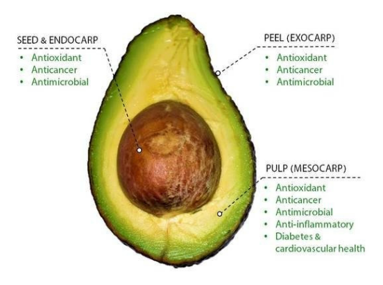
Figure 1. Avocado parts and properties. Reprinted with permission from Bhuyan et al. The Odyssey of Bioactive Compounds in Avocado (Persea americana) and Their Health Benefits. Antioxidants . Copyright (2019) MDPI [21].

An average avocado fruit weighs approximately 150–400 g [16,17]. This fruit is made up of exocarp (peel), mesocarp (pulp), endocarp, and seed (Figure 1). Mesocarp is the most abundant, representing between 52.9 and 81.3% of the fruit mass, which is in great demand because of its properties and high nutritional value [18,19]. Avocado provides vitamins, such as A, B, D, and E, that can be used for different applications (e.g., pharmaceutical, nutritional, and cosmetic industries) [19–21].