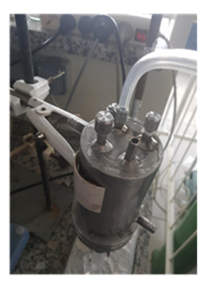
Figure S3. Photo of home-made membrane bioreactor.