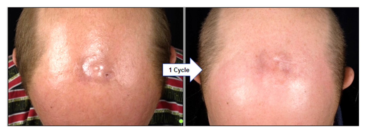
Figure 1. Clinical regression of PCFCL on the scalp in a 63-year-old patient three weeks after his first cycle of ILR. A median of one cycle (three injections) of ILR was required in our cohort to achieve complete remission (CR). PCFCL = primary cutaneous follicle center lymphoma; ILR = intralesional rituximab.

All of the relapses in both cohorts were confirmed by biopsy. Histologic findings resembled the initial diagnostic lesion for each patient, with CD20 positivity confirmed in 11 of 13 cases and not done in the other two. There was no significant difference in the follow-up (F/U) times between the ILR and IVR group (p = 0.505), and no significant difference was found in the disease-free intervals between ILR and IVR treated patients (Kaplan–Meier estimate, Figure 2, p = 0.653).