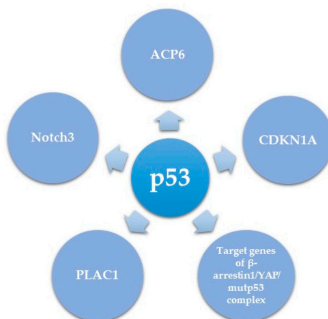
Figure 3. Downstream mediators of mutant p53 function.

Recently, Tocci and colleagues elegantly unveiled a critical role of \beta -arrestin1/YAP/mutant p53/TEAD complex in HGSC. The study demonstrated that upon endothelin-1 receptor (ET-1R) signaling induction, \beta -arrestin1 interacts with YAP, stimulating its nuclear shuttling. Once in the nucleus, \beta -arrestin1 allows the binding of YAP to mutp53, after which they are recruited with TEAD to YAP/mutp53 target gene promoters in order to regulate their transcription. This consequently results in enhanced proliferation, survival, and invasion of HGSC cell lines as well as metastasis in patient-derived xenograft models. Interestingly this manuscript clearly shows a GOF role to mutant p53 as part of a transcriptional complex, without involvement of WT p53, suggesting a new GOF role for mutant p53 [109].