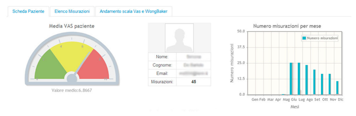
Figure 3. The virtual platform (http://ihcs.terin.it/home) shows the summary of all reports and mean VAS values in a representative CM patient. The original legends in Italian language are reported.

We monitored the progress of the reports of each single user through a virtual platform (http://ihcs.terin.it/home) that allowed us to view all the reports and related items in real-time. This virtual platform shows the individual reports and graphs of any questionnaires (Figure 3).