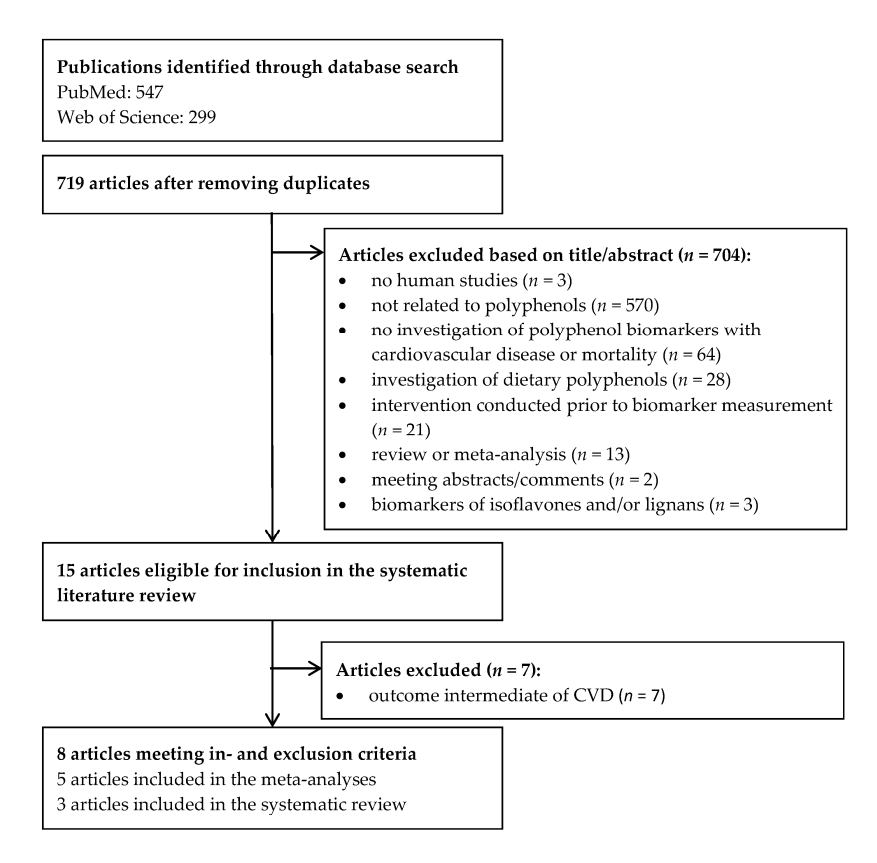
Figure 1. Flowchart of the study selection.

were of moderate to good quality with scores for both cohort and nested case-control studies ranging from five to eight stars (Supplementary Table S2).