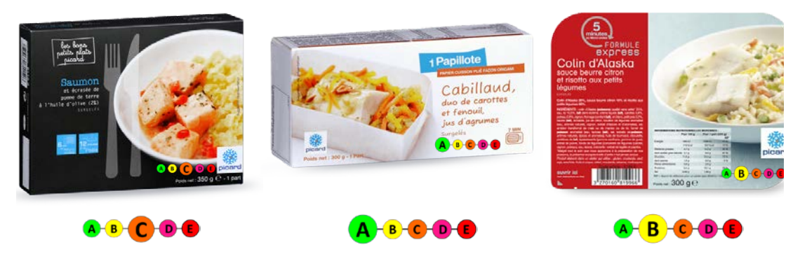
Figure 1. Screenshot of the stimulus material used in the study.

Objective understanding of the different FOP labeling formats was assessed in July 2014 via a Web-based questionnaire, under five different conditions: four alternatives corresponding to the four different FOP label formats and one alternative with no label. Subjects were asked to rank three products belonging to the same food category (e.g., Figure 1) according to their nutritional quality. Specifically, participants were shown pictures of the three products, each featuring the respective FOP label, and were asked: "From your point of view, please rank these products according to their nutritional quality". For the ranking, participants could choose among the following options: "lowest nutritional quality", "intermediate nutritional quality", "highest nutritional quality", or "I don't know". The three products were selected based on their differing nutritional quality, thus enabling ranking via the labels (except for the Tick format which enabled distinguishing only the top quality product). No other information on nutritional facts was provided and all quality labels (e.g., organic certification) were removed from the product images.