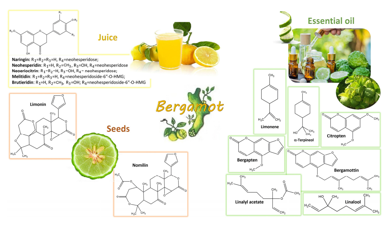
Figure 2. Main chemical composition of bergamot derivatives and byproducts. Bergamot juice is mostly characterized by flavonoids (i.e., naringin, neohesperidin, neoeriocitrin, melitidin and brutieridin), whereas bergamot seeds are characterized by limonoids (i.e., limonin and nomilin). Bergamot leaf oil is rich in monoterpenes (i.e., linalool, linalyl acetate and \alpha -terpineol) and bergamot essential oil obtained from fruit peel is mainly composed of monoterpenes (i.e., limonene, linalool and linalyl acetate), coumarins (i.e., citropten) and psoralens (i.e., bergamottin and bergapten).

Finally, the seeds and leaves of bergamot have been recently revaluated. An extract obtained from bergamot seeds, including nomilin and limonin as major components, was shown to possess antiretroviral activity against human T-lymphotropic virus type 1 (HTLV-1) infection [65]. Potentially bioactive compounds such as linally acetate, linalool, and \alpha -terpineol were also identified in bergamot leaf oil [66]. Figure 2 depicts chemical structures of the main bioactive components characterizing bergamot derivatives and byproducts.