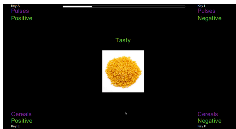
Figure 2. Presentation of the screen to participants (the original text was in French).

At set intervals, a word and a food product image appeared at the center of the screen. The word was always above the image, as shown in Figure 2. The task consisted of a total of 3 blocks with 40 trials each (10 trials for each pair of categories). The order of the three blocks was randomized between participants. For the implicit measures, the inter-trial interval was set at 300 ms [24]. Before the start of the task, the participants were given a quick training block with two animal images (bird and eagle) with positive and negative words.