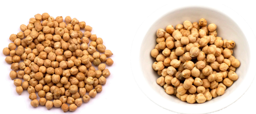
Figure 1. Example of the two images for chickpeas.