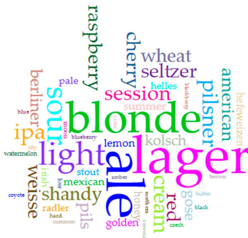
Figure 5. Word cloud (larger text indicates higher frequency of use) visualizing the frequency of word choice in the names of the lowest ABV offerings from the breweries surveyed. (Data from the authors; visualization via Voyant: https://voyant-tools.org/?corpus=51da88b672374ebe39516cd3f27ad752 ); accessed on 3 October 2022.

“sour” (11) appear most prominently (Figure 5), mirroring the findings related to beer styles. Notable also is the visibility of fruit words (e.g., raspberry, cherry, lemon). Future research could assess the motivations or drivers of this component of the low(er) alcohol beer naming conventions. An additional study might consider whether and how lower alcohol beers lean on fruit flavors to improve taste or enhance otherwise less flavorful or robust brews, if a fruity component to a beer is expected to draw the attention of particular consumer groups, or if fruit-driven flavors are more common in some seasons (i.e., summer versus winter) or styles (i.e., gose).