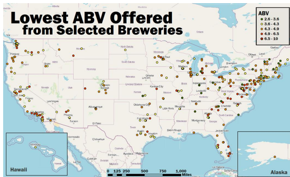
Figure 2. Map of included breweries' locations and lowest ABV on offer. (Map by AUTHOR and Heather Swienton; 17 November 2022).

However, if the outlying 10% ABV offering is removed, the average drops to 4.58% ABV. We did not conduct a significant difference check as this is not a representative sample of breweries in the US.