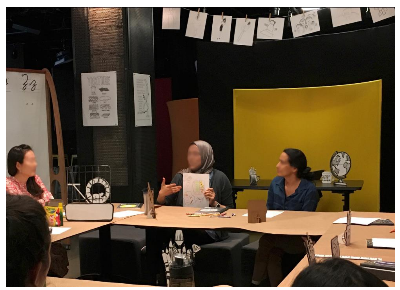
Figure 1. Image from section one of a practice workshop to display the research space and activity. The individuals in the photographs are not the research participants.

In the first section, the teachers were asked to reflect on their childhood school lunch experiences and then asked to draw a memory using paper and crayons. When finished, the teachers were asked to verbally share their drawings and experiences with the group, focusing on how their experiences impacted their current perceptions and practices related to school lunch. Immediately following the first section, the second section explored teachers' recommendations to encourage greater school lunch participation. The teachers were divided into teams of two or three people and briefed by a video recording from a fictional school principal, explaining a hypothetical new school wellness policy that mandated all teachers speak to their students about the daily lunch served in the cafeteria. Based on this video, the participants were provided a sample menu and were asked to discuss as a team, then deliver to the group three recommendations for how to engage, entice and encourage their students to eat school lunch. These first two sections were used to inspire teachers to think about school lunch and to enable in-depth discussions during the third section. Figure 1 is a photograph from the first section of the workshop displaying the research space and activity.