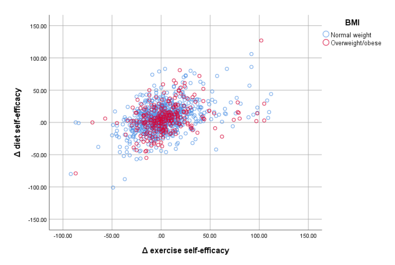
Figure 3. Scatterplot of ( \Delta ) differences (post- vs. pre-intervention) between diet and exercise selfefficacy, presented separately for adolescents with normal weight and overweight/obesity.