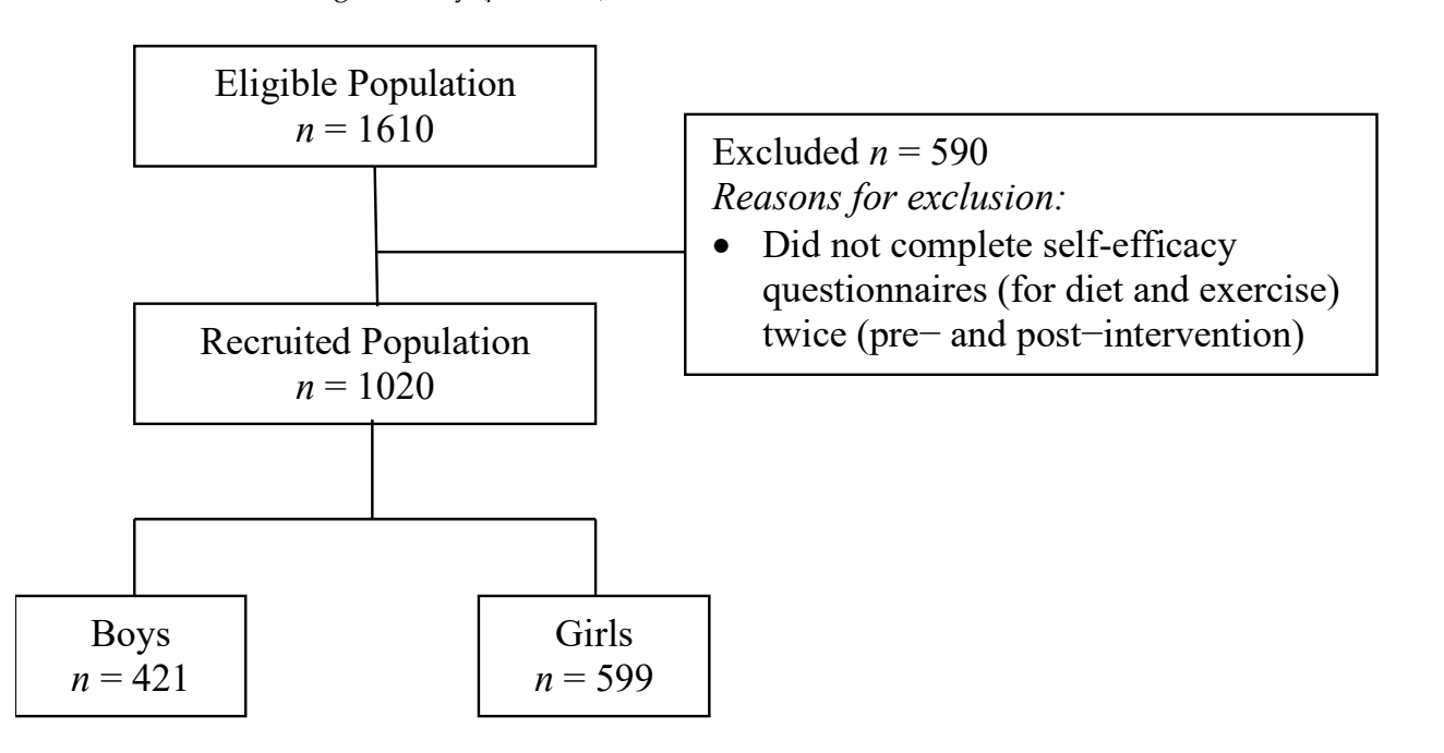
Figure 1. Flowchart of study participants.

post-intervention (p < 0.001). However, these favorable changes in exercise self-efficacy were non-significant in the participants with overweight/obesity. Overall, statistically significant decreases post-intervention were observed in WC (p = 0.007) from 70.97 ( \pm 9.14 ) cm at baseline to 70.52 ( \pm 9.04 ) cm, WHtR (p = 0.006) from 0.435 ( \pm 0.053 ) at baseline to 0.432 ( \pm 0.052 ), and WHR (p = 0.015) from 0.758 ( \pm 0.069 ) at baseline to 0.753 ( \pm 0.065 ). The statistically significant decreases in these abdominal obesity indices were mainly attributed to the adolescents with overweight/obesity. Post-intervention, mean ( \pm SD) differences in WC, BMI and BMI z-scores were equal to -0.45 ( \pm 5.15 ) cm, 0.43 ( \pm 1.01 ) kg/m<sup>2</sup> and 0.12 ( \pm 0.28 ), respectively. Considering the anticipated increases in body weight and BMI associated with expected weight gain during adolescence, post-intervention the proportion of adolescents with normal weight increased to 78.6%, whereas the proportion of adolescents with obesity decreased to 15.9% and 5.5%, respectively. Abdominal obesity, assessed by age- and ethnic-specific percentiles [27], decreased, but not significantly (p = 0.117), from 10.4% to 9.0%.