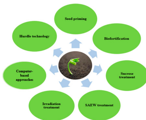
Figure 1. Recent techniques for improving biological activities of edible sprouts.

Recent investigations have shown that sprouting can enhance the accumulation of secondary metabolites. Several techniques have been employed to enhance accumulation of bioactive compounds in germinated seeds. Figure 1 provides a summary of some of the techniques that have been used to improve the bioactive content of sprouted seeds.