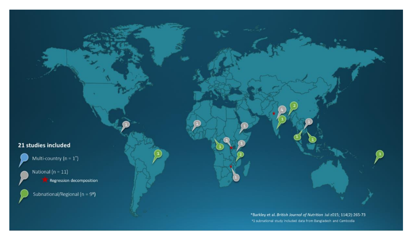
Figure 3. Setting and sample representativeness of included studies.

The 21 studies included in this review [19–39] include data from 38 countries from Asia, Africa and Latin America (Figure 3), and assess trends in anemia among WRA between 1990 and 2017. The characteristics and quality appraisal scores of the included studies, as well as the observed annualized reduction in WRA anemia, are presented in Table S1.