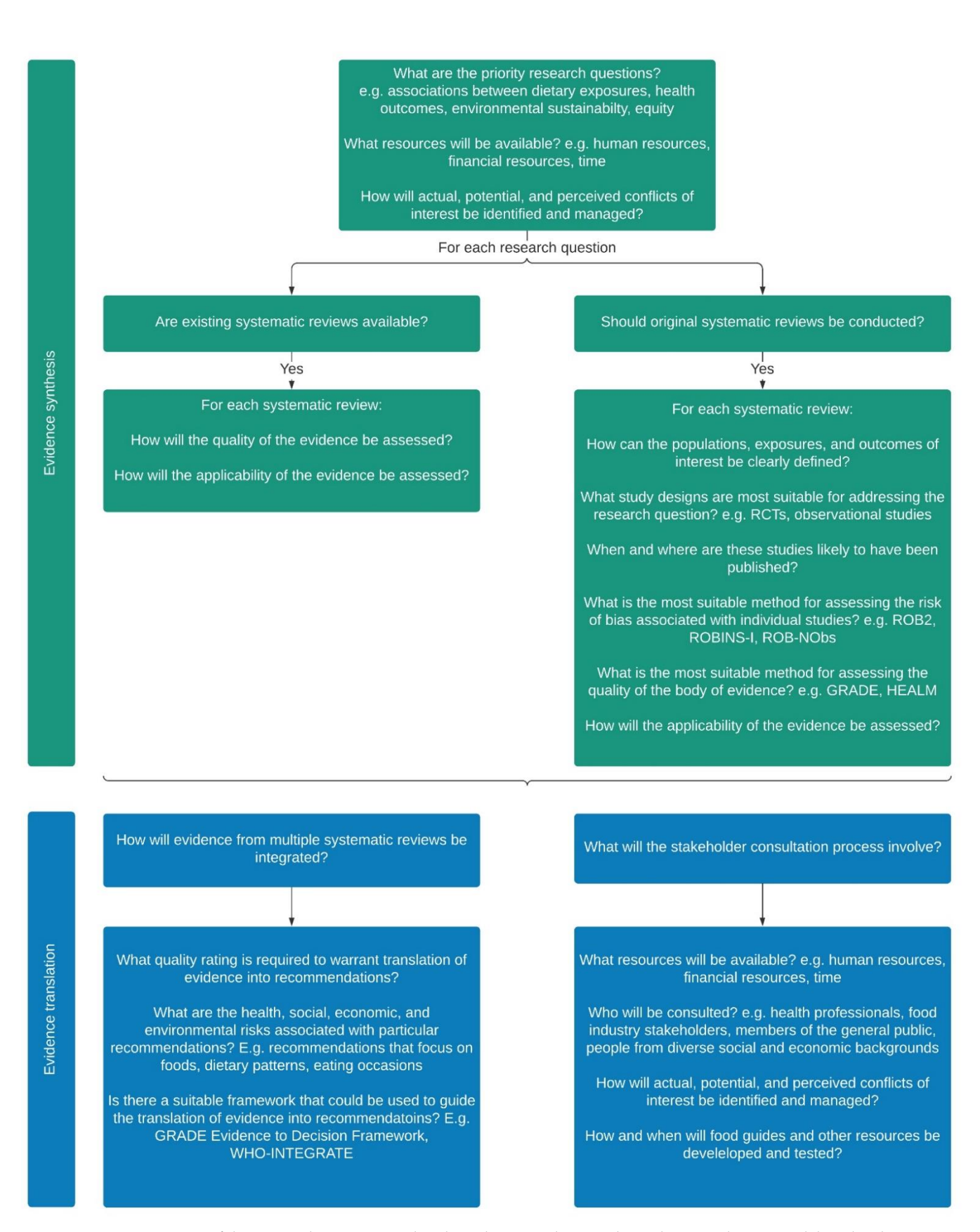
Figure 2. An overview of the practicalities associated with evidence synthesis and translation in dietary guideline development.