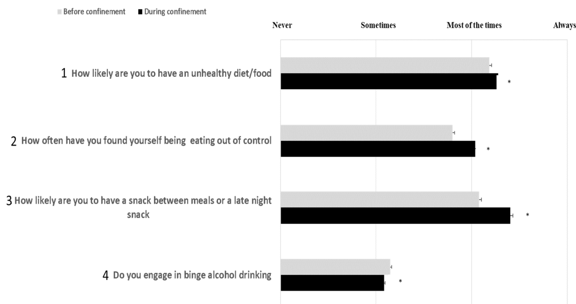
Figure 1. Participants' scores in response to the related diet behaviour questions. *: Significant differences between “before” and “during” COVID-19 home confinement period.