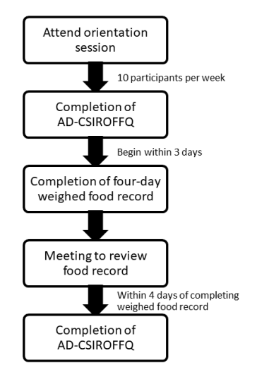
Figure 1. Schematic of the study design. AD-CSIROFFQ, (Alzheimer's disease-Commonwealth Scientific and Industrial Research Organisation Food Frequency Questionnaire).