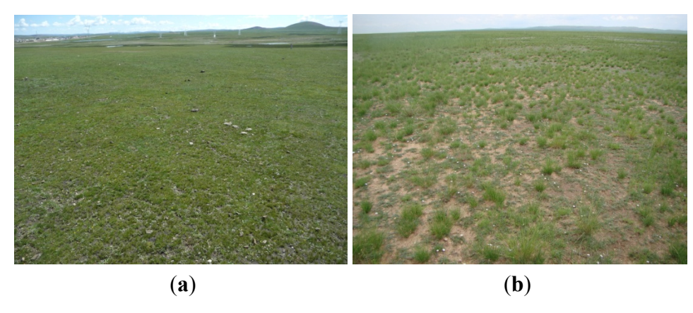
Figure 1. Two very-low canopy vegetation sites, (a) alpine steppe of the Tibetan Plateau and (b) temperate grassland in Inner Mongolia, China.

Based on the above approach, we present a new method to measure FPAR by integrating a digital camera and a Lambertian panel. To demonstrate and test the approach, low canopies suitable for SunScan were selected, and their photos were taken by the digital camera vertically, with a low reflectance panel fixed at one corner of field of view (FOV), and the four components for APAR as shown in Equation (1) are derived from the digital photo. The flowchart to derive the green vegetation FPAR from the digital photo is illustrated in Figure 2.