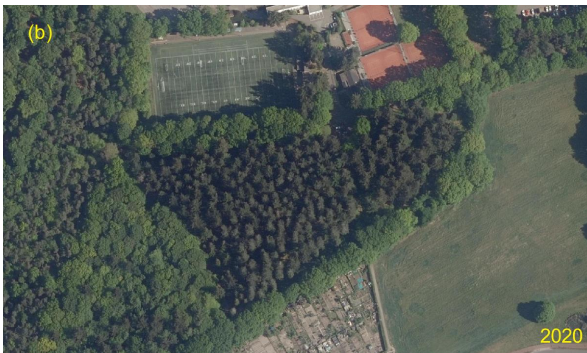
Figure S1. Aerial photographs respectively acquired in 2018(a) and 2020(b).