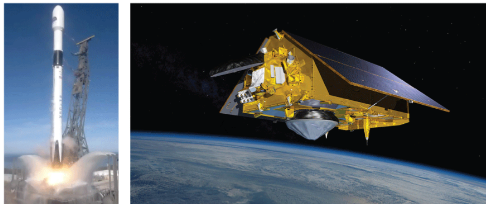
Figure 2. Sentinel-6 Michael Freilich was launched on 21 November 2020 and will be the first to offer fully focused SAR operation over all the ocean between 66°S and 66°N. To achieve a precise intercalibration it will be in a tandem orbit within 30 s of Jason-3 for 12 months.

results and data to enable a consensus to be developed. With the recent launch of Sentinel-6MF (Figure 2), the fifth satellite in the TOPEX/Jason “reference” orbit, the work of these researchers is as critical as ever for linking data from many missions (see Figure 1) so that concerns about long-term changes can be addressed with confidence.