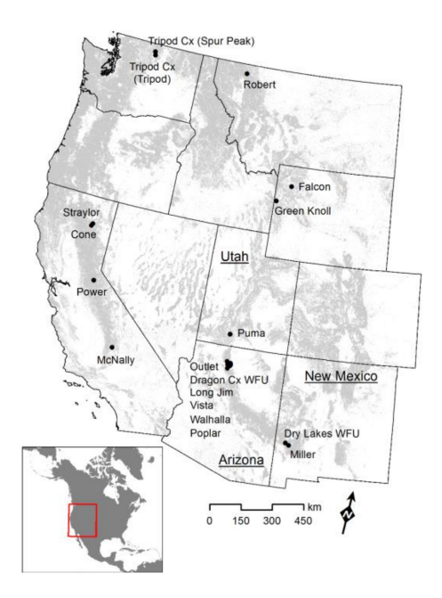
Figure 1. Location and names of the 18 fires included in the validation of the delta normalized burn ratio (dNBR), relativized delta normalized burn ratio (RdNBR), and relativized burn ratio (RBR). Forested areas in the western United States (US) are shown in gray shading. Inset shows the study area in relation to North America.

We aimed to determine whether our GEE methodology (specifically the mean compositing method) produced Landsat-based fire severity datasets with equivalent or higher validation statistics than severity datasets produced using one pre-fire and one post-fire scene (i.e., the standard approach since these metrics were introduced). This validation has three components (described below), all of which rely on 1681 field-based severity plots covering 18 fires in the western US that burned between 2001 and 2011; these are the same plots and fires that were originally evaluated by Parks et al. [8] (Figure 1) (Table 1). The field data represent the composite burn index (CBI) [6], which rates factors such as surface fuel consumption, soil char, vegetation mortality, and scorching of trees. CBI is rated on a continuous scale from zero to three, with CBI = 0 reflecting no change due to fire and CBI = 3 reflecting the highest degree of fire-induced ecological change. The fires selected by Parks et al. [8] and used in this study (Table 1) met the following criteria: (i) They had at least 40 field-based CBI plots; and (ii) at least 15% of the plots fell into each class representing low, moderate, and high severity. Of the 1681 field-based CBI plots, 30% are considered low severity (CBI < 1.25), 41% are moderate severity (CBI \geq 1.25 and < 2.25), and 29% are high severity (CBI \geq 2.25).