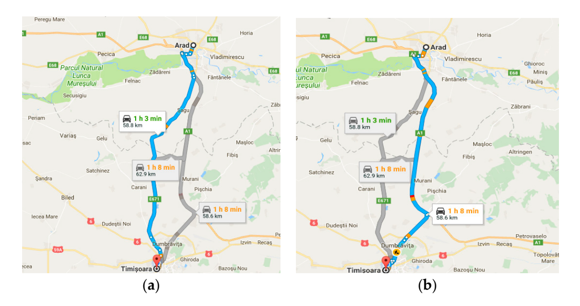
Figure 2. Roadway chosen for studying Timisoara—Arad: (a) the European national road (via DN69/E671); (b) the A1 motorway (Google Maps capture).

The connection between the two cities, Timisoara and Arad, can be covered via DN69/E671 (58.80 km) or Via A1 (58.60 km). The Timisoara–Arad motorway section was put into operation in December 2011 and has a length of 38.9 km. The difference is that this section is covered by the European national road DN69/E671. According to the data provided by Google Maps, the time duration is close for the two routes. This is because the European national road to the highway entrance is very crowded. It takes about 20 km to enter the highway. It is appreciated that on this 20-km portion, the running speed is below 40–50 km/h. In order to investigate whether there are different risk factors for injury, two types of roads were considered (national/European and motorway). These road sections are shown in Figure 2.