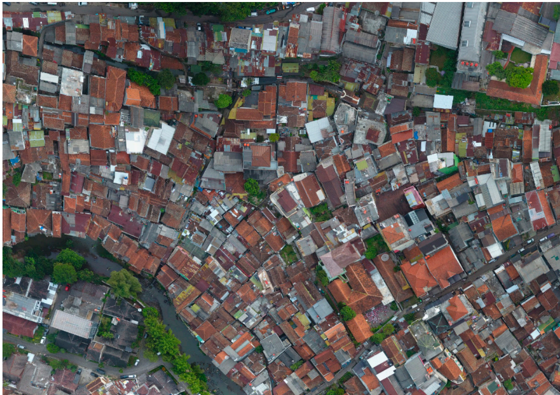
Figure 1. A key feature of informal settlements and slums in South-East Asia is the diverse rooftop architecture. Analysis of patterns of rooftop materiality can provide deeper insights into household connections to governance and political alliances. Image of kampung Lebak Siliwangi, Bandung Indonesia.

to 689 and 791 million persons in 1990 and 2000 respectively. Since 2000, this represents an increase of approximately 28% in the absolute numbers of slum dwellers' despite a percentage decrease from 39 to 30% of people living in slums in developing countries between 2000 and 2014 [15]. Thus, in the developing world, nearly one out of every three people living in cities resides in a slum often located within an informal settlement (see Figure 1).