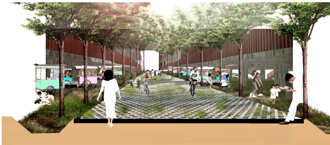
Figure 9. Image of residents in “new” sanitized expressions of public/private interface in the Tamansari Vertical Tower Housing.