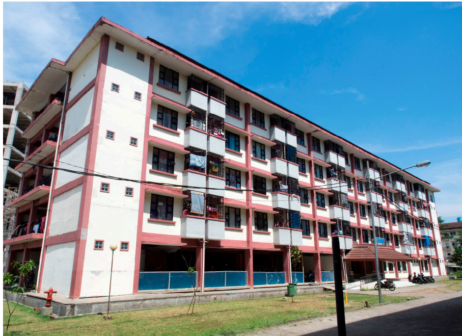
Figure 8. Recently completed 5-storey public walk-up flats at Rancacili, Bandung.