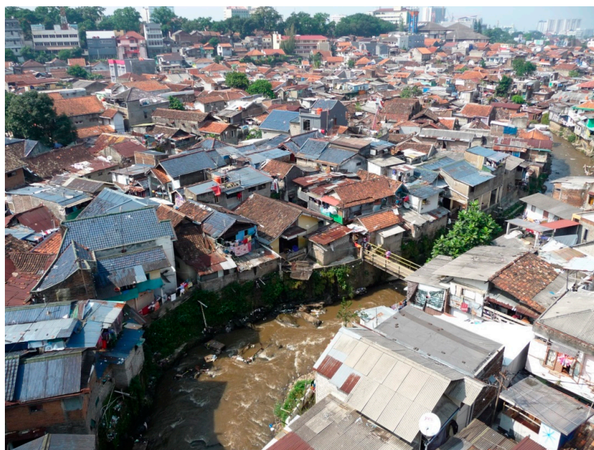
Figure 4. Kampung adjoining the Cikapundung River in the Tamansari locality in northern Bandung.

Bandung City, Cimahi City, Bandung and West Bandung Regency, had a population of 8.2 million persons in 2014 [60]. Bandung's rapid growth reflects the wider industrialization of Indonesia at the national and regional levels, including the growth of the greater Jakarta–Bandung Region. Bandung has grown into a large metropolitan centre of manufacturing, hi-tech industrial estates, commercial services, and a strong tertiary sector which has attracted both domestic and international investors [61]. Like other major urban centers in Indonesia, resultant in-migration has caused a significant increase in housing demand with poorer residents unable to buy housing from the State Housing Provider Agency ( Perumnas ) or secure housing from formal private developers due to their low or unstable incomes. As a result, much of the low-cost housing including slums remain concentrated in high density kampungs and adjoining interstitial spaces under state and to a lesser degree private land ownership. After Jakarta, Bandung has the second highest levels of urban population living in slums; some 26,000 plus dwellings with an estimated population of 120,000 residents. Many of these slums are located alongside rivers, railways, the airport, industrial areas and inner city commercial areas (see Figure 4). Despite varying efforts to improve physical and socio-economic conditions of kampungs and their residents, there has been little improvement in the physical extent of Bandung slums [60].