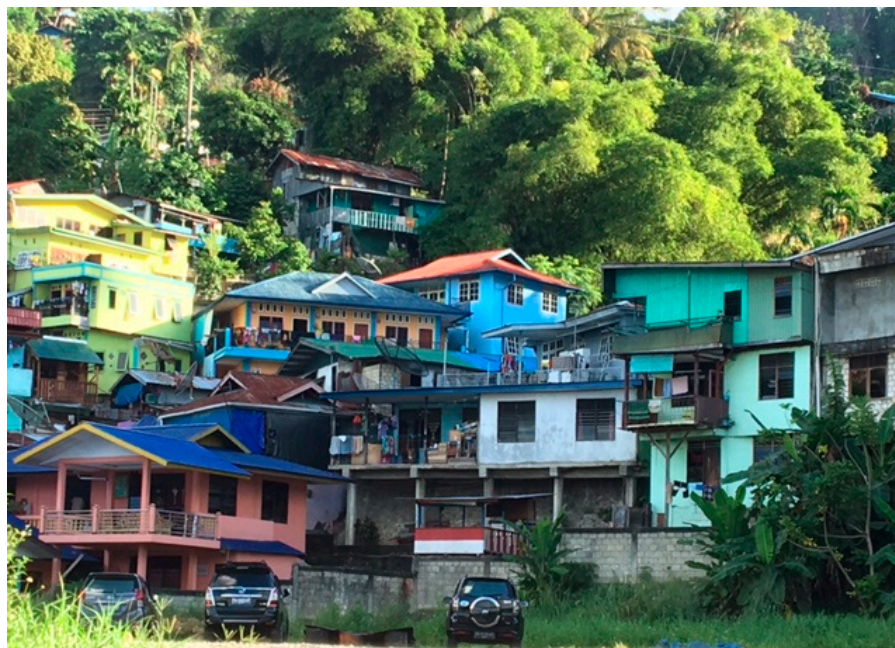
Figure 2. Informal settlements on steep slopes deemed for environmental protection in Jayapura, provincial capital of Papua, Indonesia.

estuaries, accretion lands on ocean and lagoon foreshores, electricity easements, mangrove wetlands, tidal lagoons and swamps (including their location-induced impacts such as flooding), cemeteries, peri-urban “edge” lands, waste disposal sites and land locked traditional “native villages” [12]. While this typology helps us to understand the morphology of informal settlements in the city, it also reinforces that informal settlements and slums emerge and flourish in locations that are at higher risk to climate change and environmental hazards, such as land slips, steep slopes, flood-prone areas and poor drainage [40–42] (see Figure 2). In developing countries, it is estimated four out of every ten non-permanent houses are located in areas subject to landslides, flooding and other natural disasters [43], with informal settlements in such areas with non-compliant technical codes and construction increasingly vulnerable to extreme natural events [44].