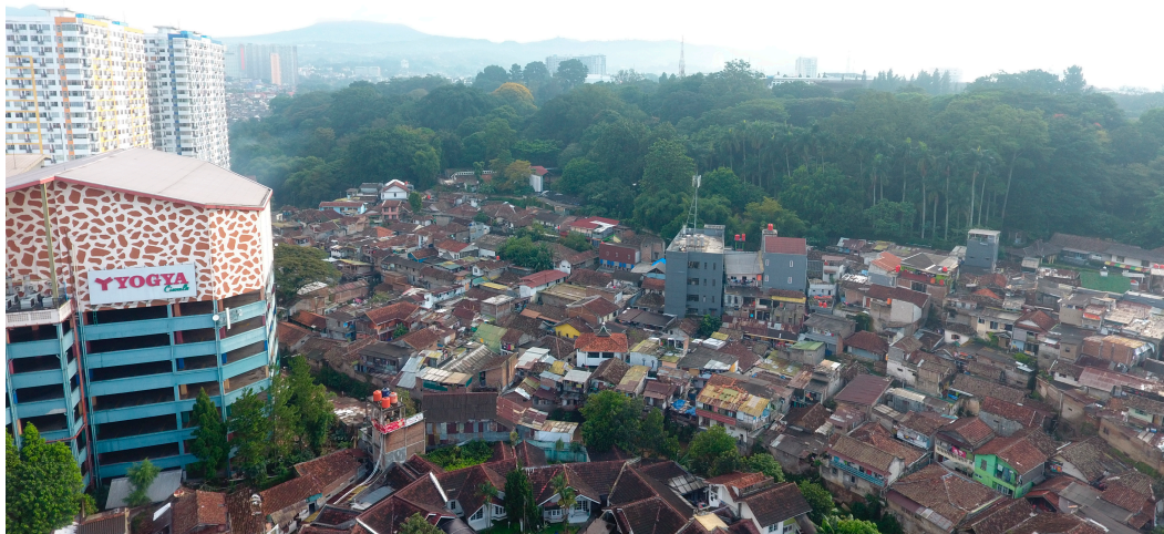
Figure 5. A shopping complex and private residential tower developments adjacent to kampung Lebak Siliwangi in northern Bandung.

upgrading plans contained in RP2KPKP, 2015, there are five prioritized locations recommended for relocation of residents (that is, proposed non-residential development) and 24 locations for slum upgrading programs. These latter locations include 13 kampungs which contain slums classified as “very poor condition” and which have been identified as a priority for apartment development during the period 2014–2019 [62]. The popular Bandung City Mayor, Ridwan Kamil, confirmed in April 2015, that his administration planned to construct these 13 apartment towers for low-income residents currently living in slums, with development involving national and local funding plus the involvement of the Public Housing Ministry and the Directorate for Human Settlements ( Ditjen Cipta Karya ) in Public Works [66].