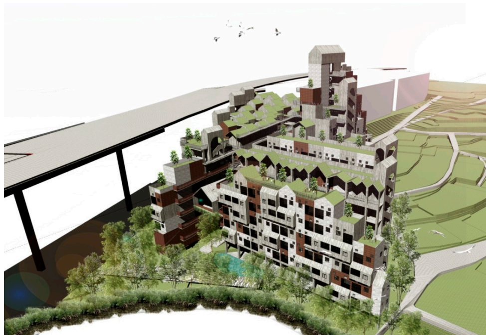
Figure 7. Perspective of the Tamansari Vertical Tower Housing. Source: [65].

Compared to the scale of public vertical tower developments in Jakarta, vertical rusunawa developments in Bandung are new with only three public apartment complexes completed in the new millennium, namely, Cingised (483 flats completed 2005), Sadang Serang (93 flats completed 2012) and Rancacili (273 units completed 2016) (see Figure 8). As the Bandung City Government publicly promotes its kampung and slum upgrading via the rusunawa vertical towers, many kampung residents remain concerned about future plans for tower development and importantly, their inability to comply with the prescribed kampung development template being implemented by the Bandung City Government. At a community meeting in RW7 in kampung Lebak Siliwangi situated to the north of the Tamansari tower proposal on 22 February 2017, residents expressed both reservation and confusion regarding designation of kampungs for future tower development and importantly, where their residents' concerns fit within the process [26]. Discussed within an atmosphere of development inevitability where developers are seeking land with unclear land status and the Bandung City Government is encouraging urban renewal (including joint venture with the private sector), residents raised the following concerns and issues: