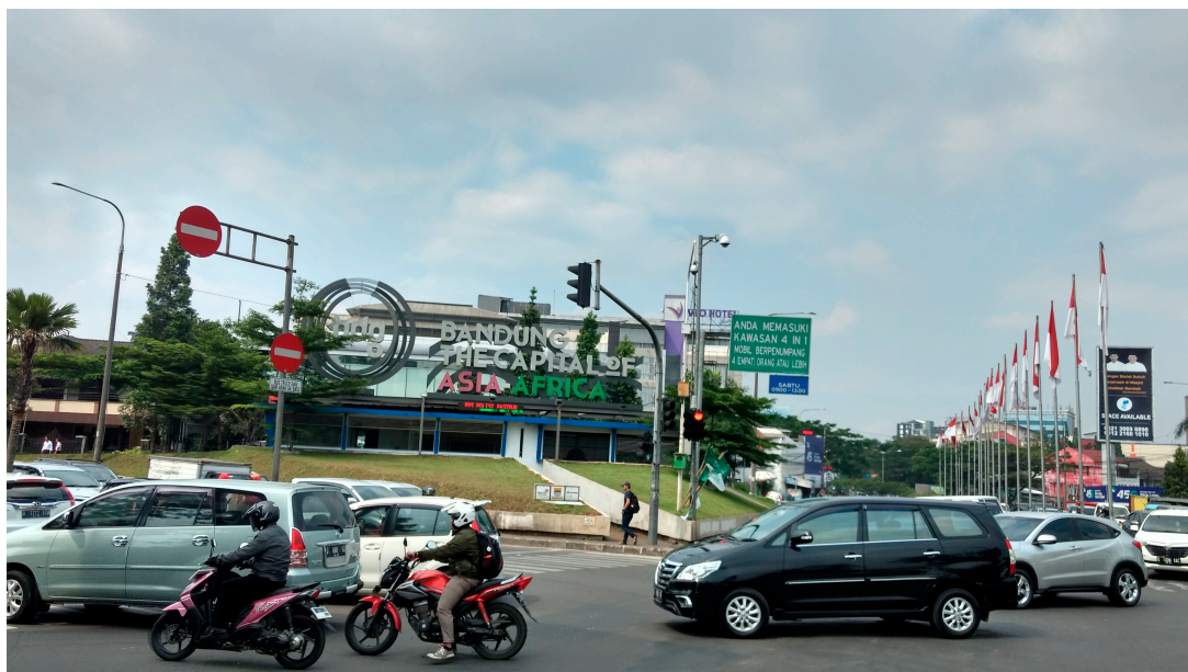
Figure 3. Bandung promotes itself as the modern capital of Asia-Africa building on the legacy of the 1955 Bandung conference held to strengthen cooperation between the newly independent states of Asia and Africa.

By the late 1980s, Bandung’s administrative area had expanded to twice its original size. As a result, the Bandung Metropolitan Area (BMA) was created in 2001 with the bulk of urban activities falling within the jurisdiction of the Bandung City Government. The latter has a population of 2.5 million persons while the total area comprising the BMA, which includes the jurisdictions of