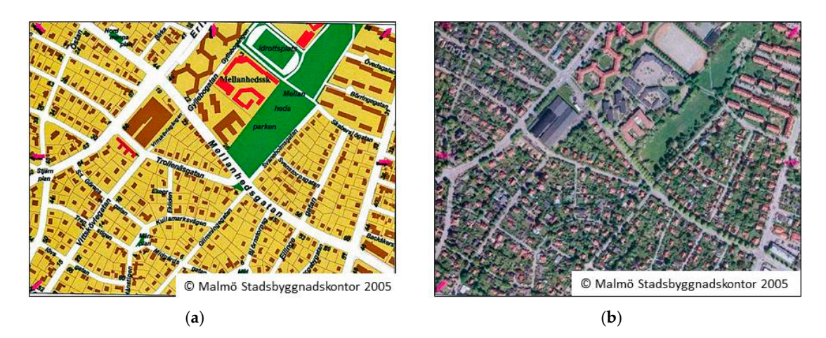
Figure 3. The standard way habit of representing "municipal green" with the green color, while privately owned land is represented with any color regardless of land use ( a ), confuses our conceptualization of the urban landscape. The quite considerable amount of private green space ( b ) is therefore not counted as a common asset, which affects the work on ecosystem services.

of maps for navigation. The point is not, however, how our surroundings are perceived from the ground (which is unaffected) but how the ground is perceived from maps, in professional planning work and regulated communication between planning authorities and citizens. Whatever advantages the current way of mapping cities may have, it is not conducive to GI innovation or implementation.