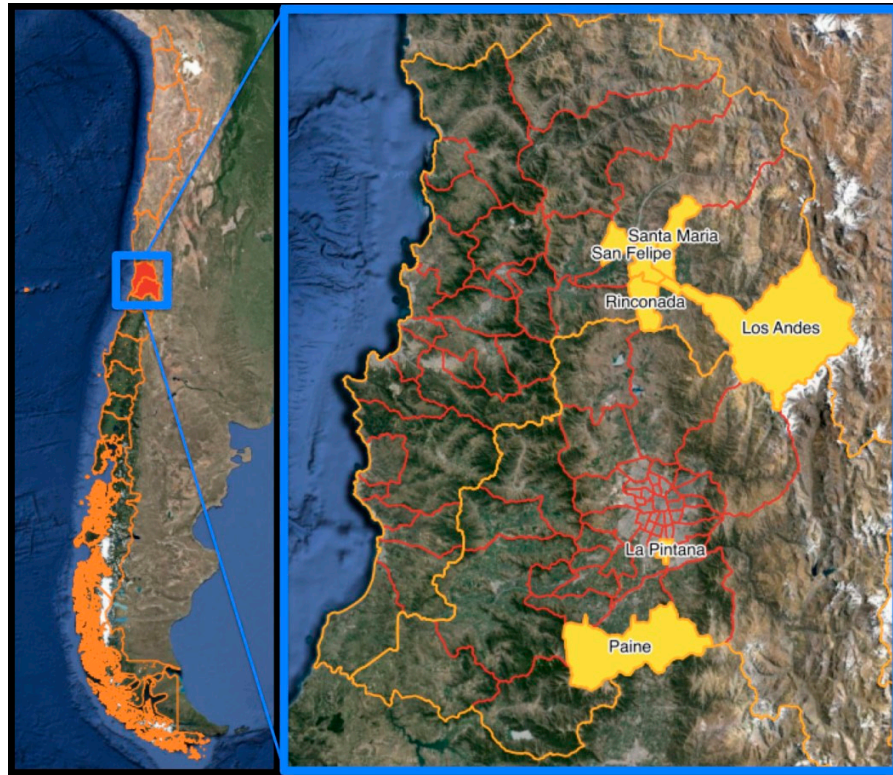
Figure 1. Study area.

Six counties in two administrative regions of central Chile were selected, two in the Metropolitan Region: La Pintana and Paine; and four in the Aconcagua Valley: Los Andes, San Felipe, Santa María, Los Andes and Rinconada de Los Andes. The location of these sites is shown in Figure 1, and their basic demographic characterization is presented in Table 1. Agriculture constitutes one of the top three sources of employment for four of these counties, with the exceptions of La Pintana and Los Andes [34].