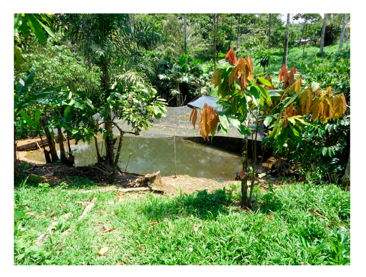
Figure 4. Aesthetic elements of the chakra .

inform the traditional Kichwa cosmology are essential in the construction and management practices of the chakra .