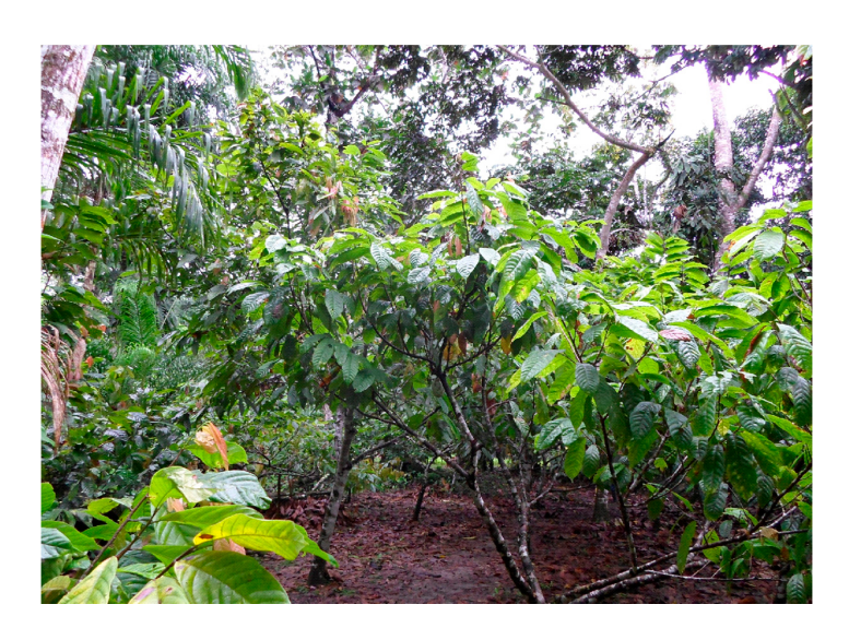
Figure 2. Cocoa trees, shade trees and the different heights of the chakra .