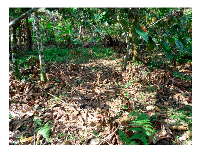
Figure 3. Maintenance of soil fertility based on nutrient recirculation.

Considering the characteristics of Amazonian land, e.g., the shallowness of the fertile soil layer and the deficiencies of certain nutrients, soil management is an essential element in the search of sustainable agricultural practices. Trees have three principal functions. Firstly, because an equatorial forest has a high capacity for the production of organic matter, trees provide much of the organic matter that breaks down and acts as an element of nutrient fixation in the soil. Thus, trees provide the closure of the material and nutrient cycles in the soil. Pruning rests and fallen leaves are also used for this purpose (see Figure 3). Secondly, trees capture inorganic nutrients from deeper soil layers and introduce them into the vegetation cycle, thus enriching superficial soil layers [30]. Finally, trees prevent erosion and the loss of the thin fertile soil layer.