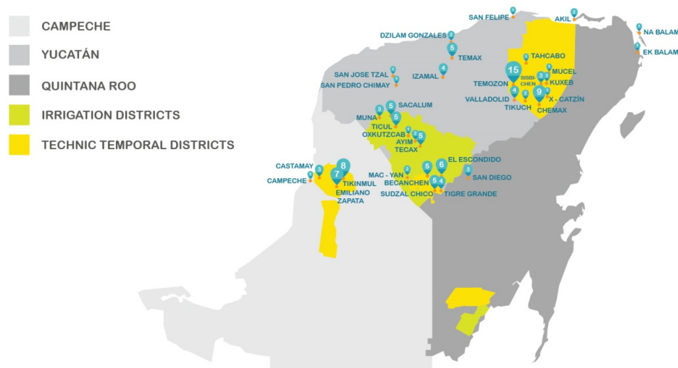
Figure 2. Distribution of producers in the Yucatan Peninsula.

with water” (BP1), “Stop wasteful behavior” (BP2), “Develop a water-saving mentality” (BP3), “Do not pollute the water in the area” (BP4).