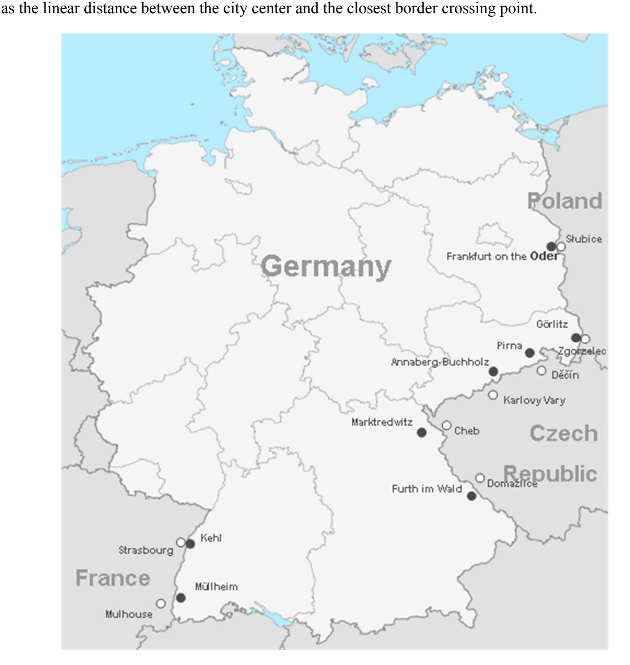
Figure 3. Survey sampling points.

participants from a particular city, and by the distance of the city to the border. Information about the net household income per capita was extracted from Eurostat data for the various regions. The salience of historic conflicts was measured by asking respondents to indicate to what degree they feel emotionally strained by historic events pertaining to a specific region, e.g., German occupation in World War II, or the expulsion of Germans in the sequelae of the war. The items were developed for the current project. Here survey data were aggregated to the city level. Distance of a city to the border was operationalized as the linear distance hotware the site center and the closest horder emotion point.