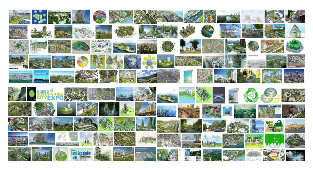
Figure 1. Green and blue are predominant colors in visions of future cities. The first four pages of Google image search results on "sustainable cities" from March 15 in 2013.