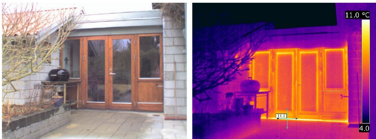
Figure 3. Poorly insulated window/door section along a corridor that connects the main house with an annex.

The U-value is measured to be U-value = 1.44 (Id 1, the wood parapet). The outer wall next to the wind/door section was measured to be U-value = 0.80 (Id 2). See Table 1 for measured U-values and corresponding identification (Id-numbers).