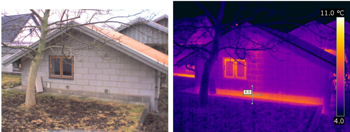
Figure 4. Gable (west) with window to the bedroom.

This room's outer wall was previously insulated from inside. However, a thermal bridge interruption was omitted along the floor concrete slab and therefore the socket shows orange on the thermography to the right. The U-value was measured to 1.03 (Id 19) compared with the insulated outerwall U-value = 0.32 (Id 22), see Table 1.