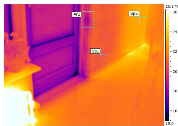
Figure 5. The transition between the wall and the floor is acceptable.

No leaks were registered in this door. The dark shades of the door indicate cold surfaces and a relatively large heat loss through the door. That corresponds to a high U-value, which is confirmed by Table 1, where the door is measured to U-value = 1.72 (Id 9) compared with the outer wall's U-value = 0.89 (Id 11).