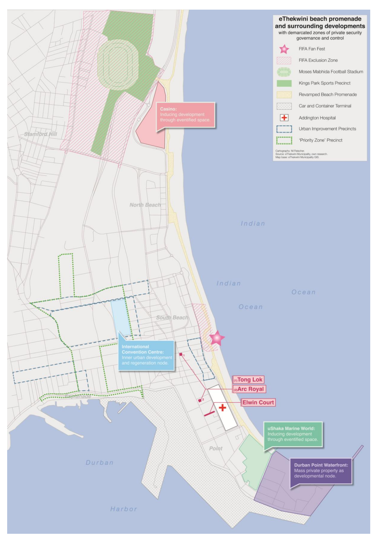
Figure 3. eThekwini's "Golden Mile" beach promenade and World Cup related developments.

Point/South Beach is up until now an area, that can, according to statistics and public discourse, be termed as rather dodgy and crime-ridden [73,74].