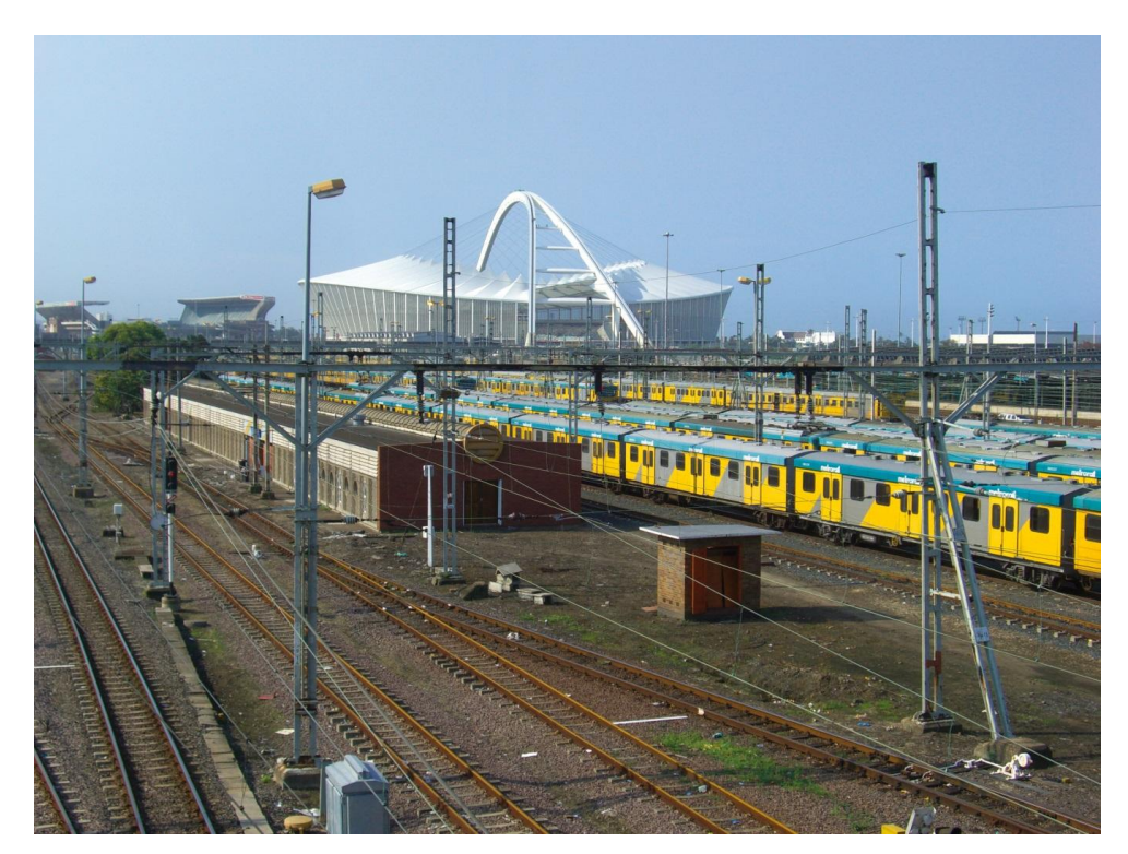
Figure 1. eThekwini's Mhoses Mabhida Stadium with the old rugby stadium behind.

Despite the city's peripheral stance compared to Johannesburg and Cape Town, the SPU was well aware of the strategic position to function as a valuable hosting destination in terms of its all-year around warm climate and its huge potential to produce TV imageries with its kilometers-long beach promenade, the so-called Golden Mile [59]. This can be illustrated by the way the city put pressure on FIFA and the Local Organizing Committee on the national level to share the costs of 3.1 billion Rand (about 300 million USD) for the newly built Moses Mabhida Stadium with its iconic roof (see Figure 1) by otherwise upgrading the smaller rugby stadium instead and refusing to host up to seven matches including one semi-final (see also [58]).