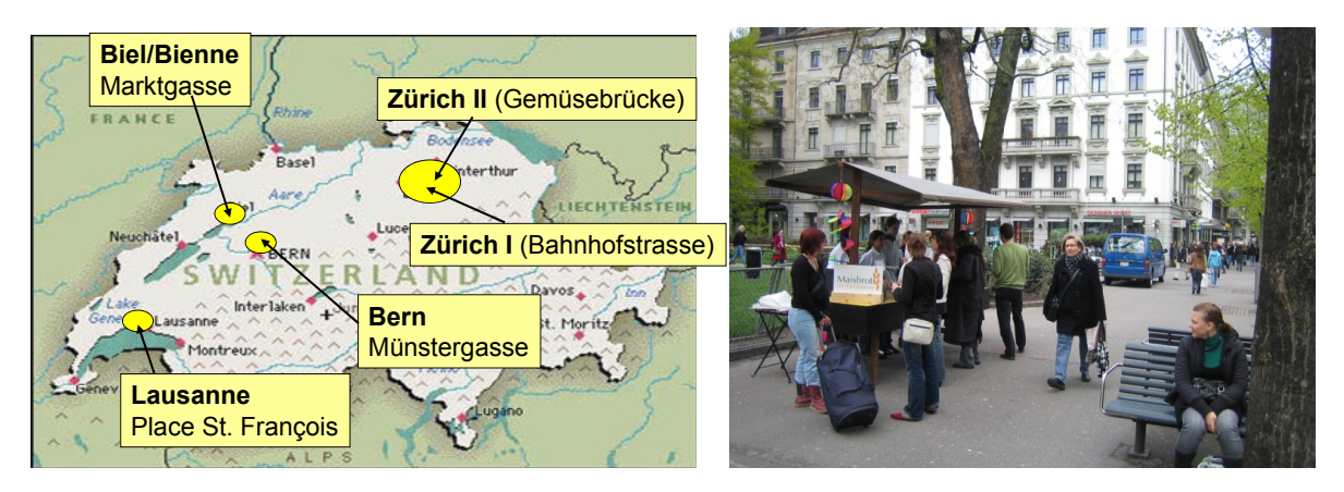
Figure 1. Location and design of the market stands in Switzerland.

All types of bread were freshly prepared every morning by bakers in the region. While bakers were free to buy the conventional corn, the organic corn was bought from a Swiss mill that only accepts certified organic crops (Bio Knospe). The transgenic corn variety 'Bt-11' was imported from Spain (where it was approved for cultivation in a pilot project) and subsequently milled in a special Swiss mill. 'Bt 11' corn has the advantage of not containing an antibiotic marker gene, allegedly a major concern for Swiss consumers. It has also a significantly lower amount of mycotoxins than conventional or organic corn [74]. Furthermore, the Bt toxin is not expressed in the pollen, which prevents beneficial non-target insects from being affected. An information sheet that contained all the legal, economic and scientific details about Bt 11 corn was offered to consumers at the market stand in case they wanted to know more about it. No deception of the consumer was necessary and the sale complied with all legal requirements.