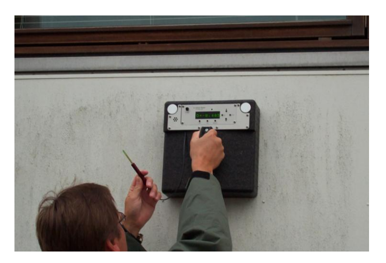
Figure 2. U-value meter, shown in principle [3].

Figure 1. Picture of U-value meter in use.