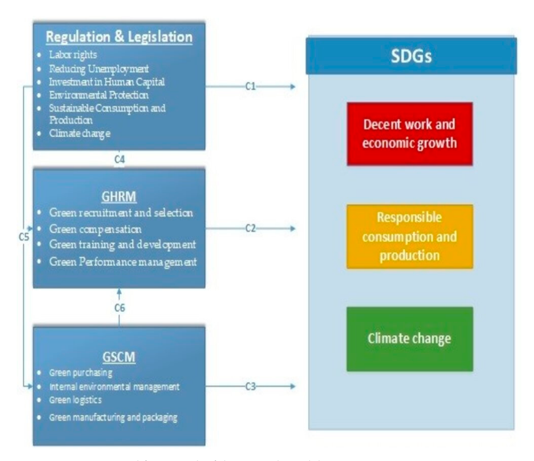
Figure 3. A conceptual framework of the research model.