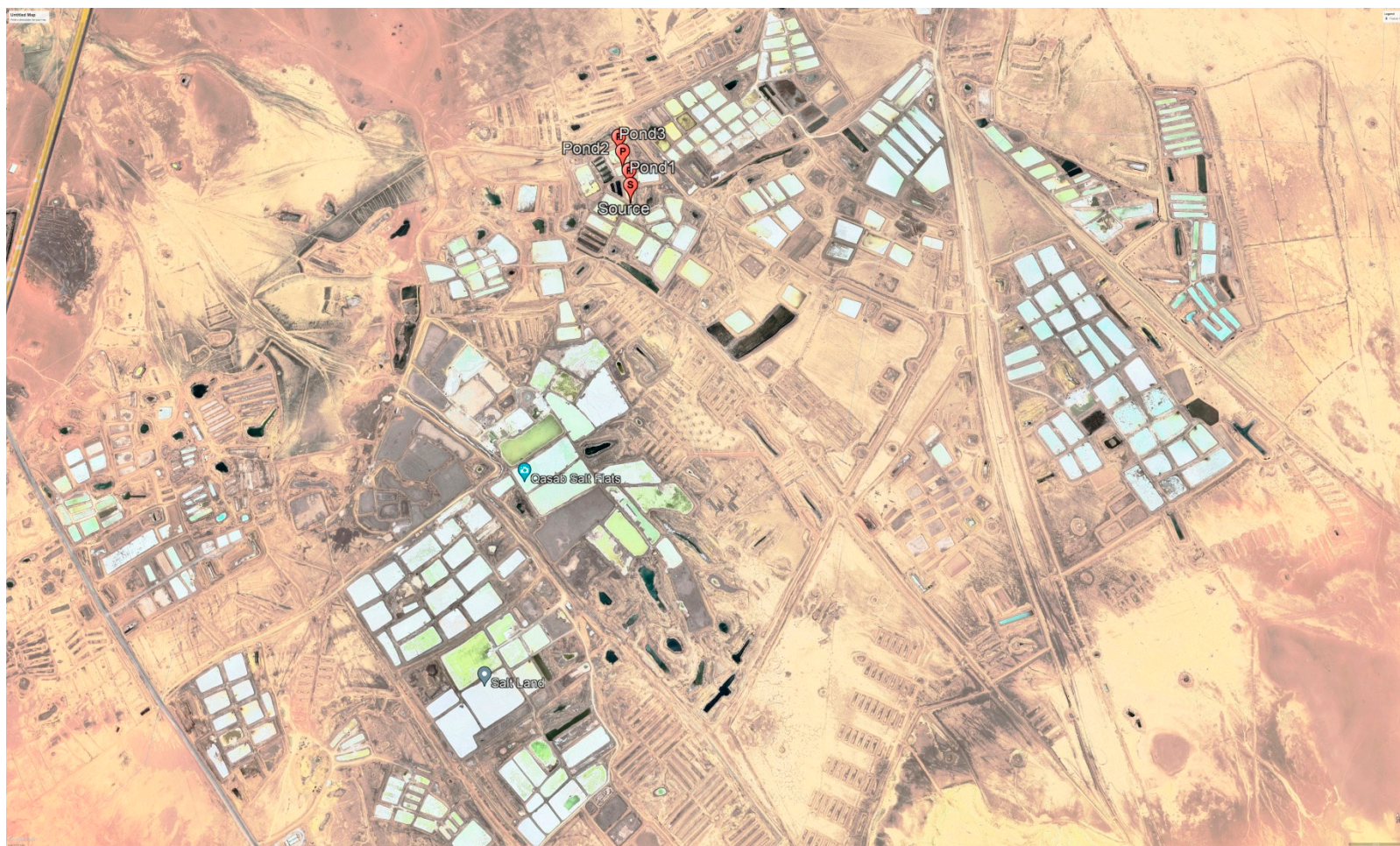
Figure S1. Areal view of the study area and the solar evaporation ponds.