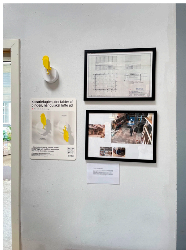
Figure 10. Framed original construction drawings and photos serve as wall decorations, narrating the building's history and former use as a garage.

One form of storytelling we identified was the presence of written or orally transmitted narratives regarding the building's history. Interviews with store representatives consistently revealed that they had studied the building's history and were eager to share narratives about previous occupants and function(s). The stories did not have to be grand tales; even small testimonies regarding the buildings' previous uses were appreciated by new users. Images were also occasionally used to convey the building's history to customers; for example, in a case where original construction drawings and photos of the original workshop were used as wall decorations (Figure 10).