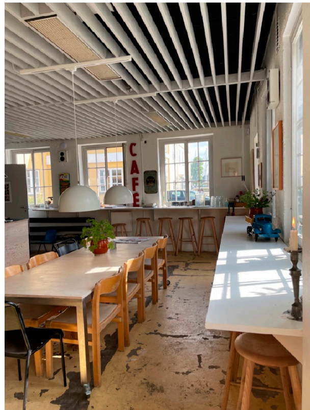
Figure 7. An example of a café with fixtures, such as furniture, lamps, and decoration, that can be removed without leaving any marks, except holes in the walls, thereby classifying it as an installation. The floor, walls, and windows are original. It is unknown when the recessed ceiling grid was installed. It is not original and was not installed by the current shop owners.

Some cases followed a strategy that we would describe as a cross between insertion and installation. This hybrid strategy mainly consists of elements that can be removed but borrows characteristics from the insertion strategy, such as glass walls customized to the space to create a boundary between the café and the roasting area (Figure 8). In addition, fixtures, such as counters, may be customized to fit the size of the space, but they can be removed without changing the space in any manner. For these reasons, we argue that the hybrid strategy leans more toward installation than insertion. A few cases employed the intervention strategy. In these cases, the cafés were part of larger remodeling projects—for example, a hotel or a showroom—where the main purpose of the remodeling was something other than the establishment of a café.