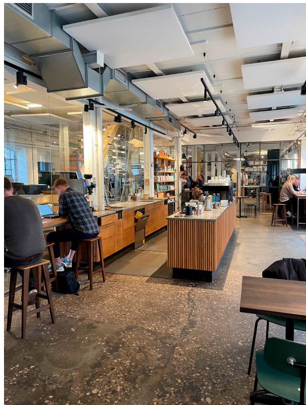
Figure 8. An example of a shop in which furniture and glass walls have been implemented between the café and roasting area to fit the size of the space. These walls are customized for the café interior but could be removed without changing the original structure of the building, leading us to categorize this case as a combination of insertion and installation.

When asked whether they generally preferred to locate coffee shops in repurposed buildings, all store representatives answered that they appreciated the old buildings for atmospheric reasons. Some described how they chose to preserve and expose elements of the original building; often those that helped to convey narratives about its prior use or matched the intended brand identity, as in an example where the remodeling strategy and open layout of the space were intended to reflect transparency as a brand value. This topic will be discussed further in Section 5.3.3.