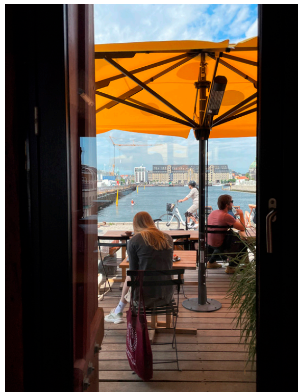
Figure 15. An example of an outdoor seating area with a view of the neighborhood, where planters and parasols are used to frame the café's outdoor areas.