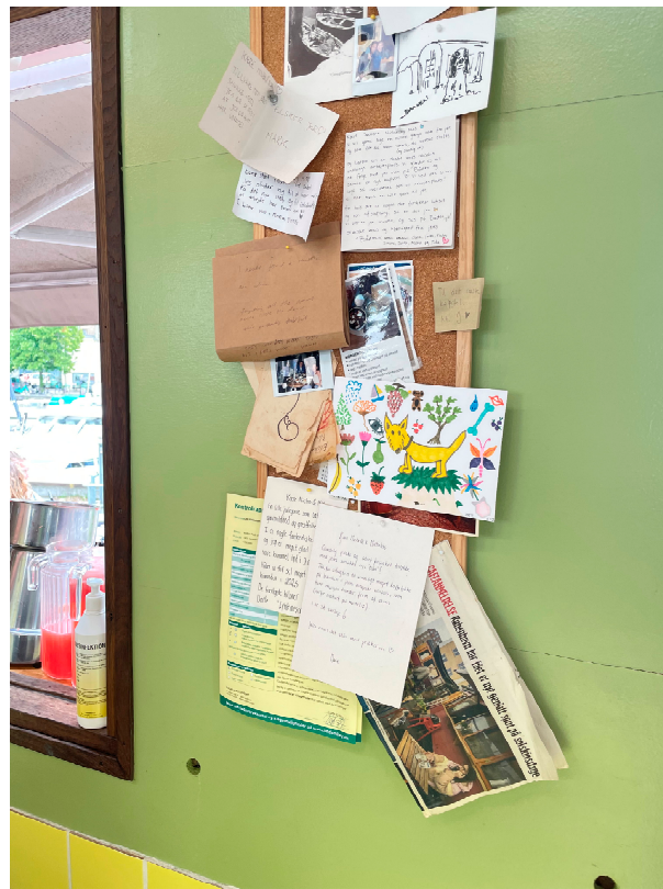
Figure 12. Example of a café engaging with the community through information boards presenting drawings, messages, and newspaper articles on the café.