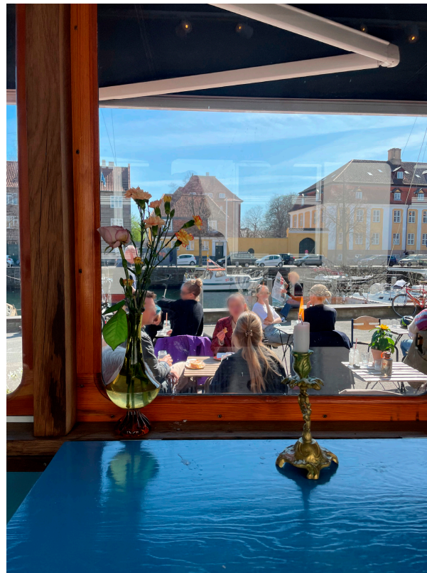
Figure 13. An example of a canal-facing café in which bar tables and inside seats are strategically arranged for guests to enjoy the neighborhood view. An outdoor seating area is implemented just outside the facade, nestled between the café and the canal. A sidewalk separates the outdoor area from the canal, allowing pedestrians or cyclists to pass by. When the café's chairs are occupied, guests often order coffee and sit on the canal's edge.

Another benefit of remote districts is that buildings are less densely packed, thereby offering access to spacious, sunlit outdoor areas. Unlike in the city center, low-rise buildings and the ample space between them allow sunlight to filter down between the buildings: "There are not that many places in Copenhagen where you have this much space", a storeowner mentioned, explaining that his shop is in sunlight from eight in the morning to late in the evening. "This is unusual in Copenhagen. Usually, other buildings block the view or block the sunlight", he said, and went on to explain that many of his regular visitors enjoy sitting outside in the sunshine.