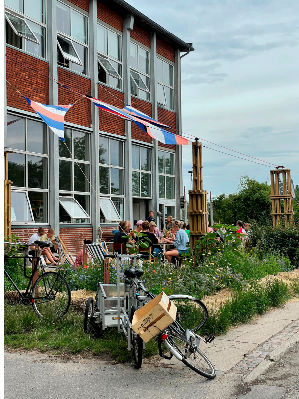
Figure 3. An example of a large outdoor seating area outside a café in an industrial building. The seats are arranged so that customers can overlook the neighborhood, while plants and awnings are used to frame the outdoor seating area. Large windows and doors create a seamless transition between the café’s interior and exterior.

Spaciousness was commonly mentioned in reference to both outdoor seating areas (Figure 3) and interiors (Figure 4) as a source of pleasure: “I feel like it’s very, like, airy. I like that. In a sense, there is a lot of space. The ceilings are high. Like, you can breathe”.