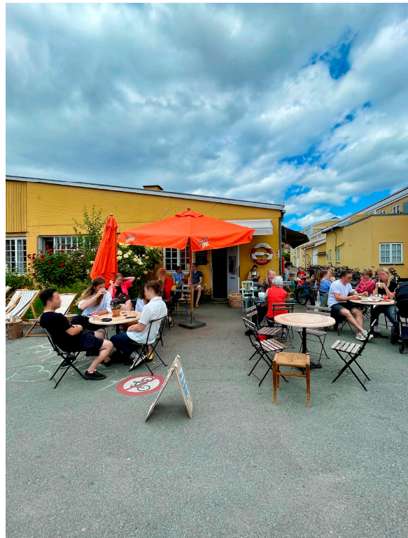
Figure 14. A café located in a former industrial building in a quiet area with minimal traffic. The café itself is relatively small, but the outdoor area accommodates additional guests. The road in front of the café is exclusively for pedestrian traffic, with no provision for car or bicycle travel in the area, resulting in a tranquil environment free from vehicular traffic and other noise.