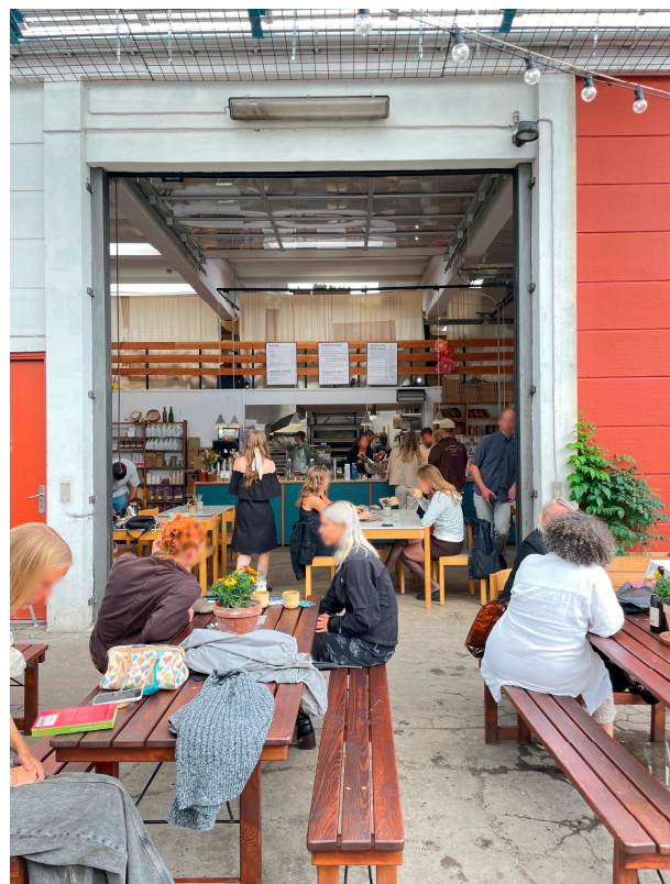
Figure 5. This café, located in a former garage, features a large opening in the form of a garage door, allowing for a seamless transition between the outdoor and indoor areas. Indoors, the tables are smaller, creating a more intimate space, while outdoors, the long tables invite guests from different parties to sit together. For events that require a performance, the benches and tables are moved to the side to make room for a stage in the center.

We also recorded testimonies demonstrating how added activities might facilitate meeting new people: “I got to talk to some really cool people that I would not have gotten the chance to know otherwise”. Social interactions were also observed during the participant observations. The layout of the seats, particularly outdoor seats, was often arranged so that seated guests could interact with arriving guests or passersby (Figures 3 and 5).