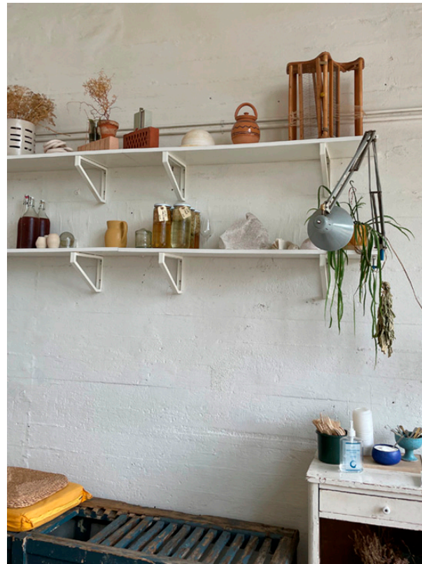
Figure 11. Ceramics from a previous occupant are showcased on café shelves as decorative pieces.

Conversations with staff members who were not owners and had not participated in the renovation process also revealed some level of knowledge. They could often point out traces of the buildings' previous lives. For example, a barista related that the former occupant was a ceramic studio and that objects produced in that studio are now used as decorative items in the shop (Figure 11).