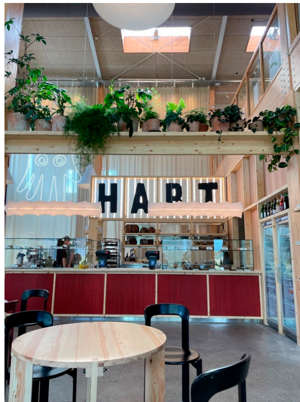
Figure 4. An example of a spacious interior. The building’s high ceiling has been preserved. On the back wall, the room’s height is complemented by new full-height curtains and large, decorative branding elements. Within the space, large pendant lights are suspended, and plants are arranged on ledges. These new additions help create intimacy in an otherwise very large room.

Many interviewees explained how they tended to stay longer in the café than expected because they felt that the spaciousness encouraged lingering : “One of the things about this place is that, of course, there is a café, but it is spacious enough, so it’s ok that you just camp here and do your thing for whatever time. It’s great”, and “You can just do whatever you want. You can leave after five minutes, or you can sit here for a long time. I think it’s a really comfortable place”. Others expressed how the pleasant atmosphere made them forget about time: “We planned to be here for like an hour and then go climbing. But then we’ve been here for like three hours, four hours now, so I don’t think we will go climbing anyway. Yes, we are on our second round now”. Another informant said that had she visited another place, she might not have stayed as long.