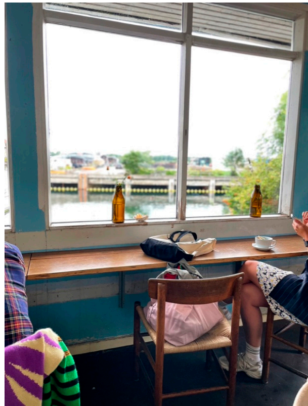
Figure 9. In this café, a wall was intentionally left untreated, revealing through variations in paint that a bench once hung on the wall when the building served as a waiting area for the ferry.

Customers showed less knowledge about the history of the buildings. However, most customers we interviewed were aware that the café was located in a repurposed building. They often knew about the building's origin or were able to provide informed guesses. Like the store representatives, customers expressed appreciation for preserving the buildings: "I think it's nice to have a building that has kind of a history behind it", one customer said. She added that she does not have this experience in a new café. However, the interviews with consumers also revealed that the actual histories of the buildings did not influence their decision to visit them. For customers, the current atmosphere of the shop was more important: