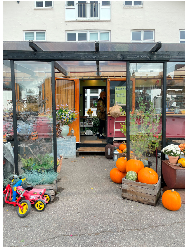
Figure 6. An example of a café that set up a basket with blankets for guests to use and offered children the option of borrowing toys, books, or small bicycles.

Our observations revealed that the more spacious cafés could often offer comfortable lounge chairs, dining chairs, stools, and benches. Some store owners also mentioned that spaciousness allows for multiple seating options: “We have space for people to bring children and dogs, and we also intend to accommodate older individuals, for example, by having some comfortable armchairs”, a store owner said. Additionally, baskets with blankets, toys, water bowls for dogs, books, and children’s bikes were observed at numerous cafés (Figure 6).