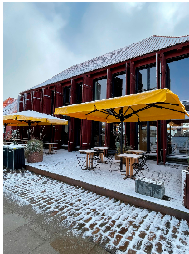
Figure 16. An example of the all-year presence of outdoor furniture, even when the weather makes outdoor seating unappealing.