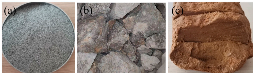
Figure S1. Cover material: (a) tailing; (b) waste rock; (c) HDS clay

In the supplementary materials, we have provided images of materials and some experimental data tables to further support the results and analysis presented in this article.