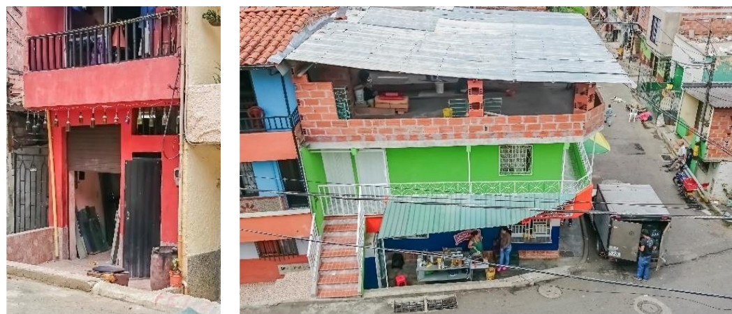
Figure 12. Enabling a mix of living, visiting, and working (left); from somewhat temporary to relatively permanent construction materials (right).

Changing from temporary materials to more permanent ones by replacing or repairing the construction materials is another increment (Figure 12, right). This increment of change can be followed by painting and/or rendering. It can also contribute to the construction quality and appearance of the buildings. The change from somewhat temporary to relatively permanent materials can also be considered as a form of informal upgrading.