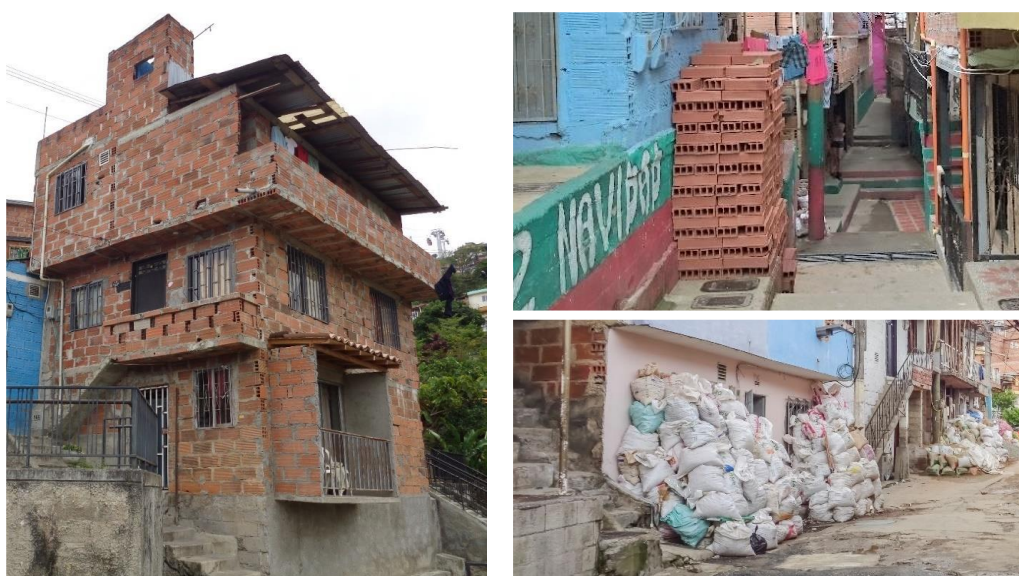
Figure 9. Adding multiple rooms: adding permanent rooms (left); storing materials against a blank wall (upper right); storing material in front of a house (lower right).

Adding verandas, balconies, and/or roof terraces is a key increment of change. Verandas often appropriate parts of the public space to create a semi-private space (Figure 10, left). The added verandas are often located along the main streets. Most of the balconies providing the possibility of surveillance are also located along the streets (Figure 10, middle). Adding roof terraces is among the most common increments of change in Comuna Nororiental. Roof terraces are likely to be replaced by multiple rooms in the future as the required resources become available. Adding a roof terrace is about enclosing the existing rooftops to provide a horizontal enclosure by building half-walls and/or a vertical enclosure for an already horizontally enclosed roof terrace by adding a temporary roof with galvanised sheets (Figure 10, right). Verandas, balconies, and roof terraces provide possibilities for accommodating a diverse range of somewhat temporary activities, including storing materials and drying clothes, among others.