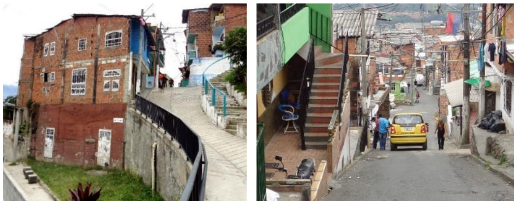
Figure 3. Multiple entries at different levels ( left ); setbacks facing the streets accommodating vehicular and pedestrian flows ( right ).

about 70x70 m to 100x100 m, surrounded by a network of car access, forming an irregular grid. Lots are often loosely defined, with some narrow laneways providing access to the areas located deep within the urban blocks. Due to the steep topography of the area, multiple points of entry to certain buildings have become accessible at different levels (Figure 3, left). Most buildings incorporate setbacks, which work as a threshold between public and private territories (Figure 3, right). Setbacks generally vary in depth from about 0.5 m to 3 m.