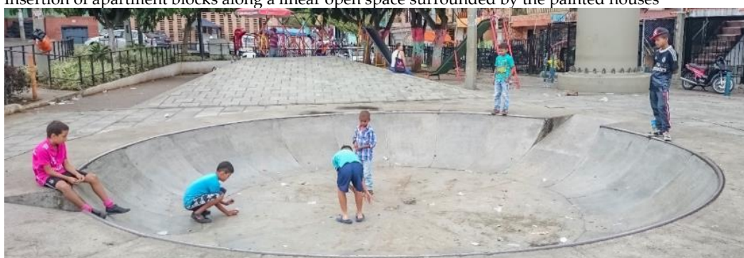
Provision of public open space in proximity to the cable metro stations