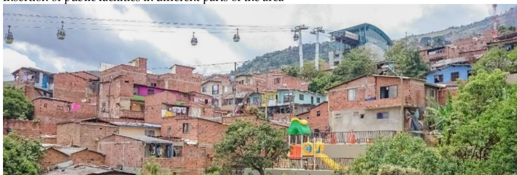
Insertion of a cable metro system that is integrated with the metro system of the city