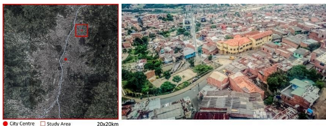
Figure 1. The study area in Medellin, Colombia.

Multiple research methods were deployed to explore the shaping of public space in the selected study area with a focus on spatial structures and incremental adaptations. Given that informal settlements are among the challenging urban environments to research, the attempt was to use unobtrusive methods during the fieldwork. The data on spatial structures and incremental adaptations were primarily collected through a mix of non-participant direct observation, extensive urban photography, and field notes. The selected study area was explored at two scales. The spatial structures were analysed at the neighbourhood scale with a focus on the urban morphologies, including access network, building density, and functional mix. The street-life density, public/private interface, and loose parts were explored at the street scale.