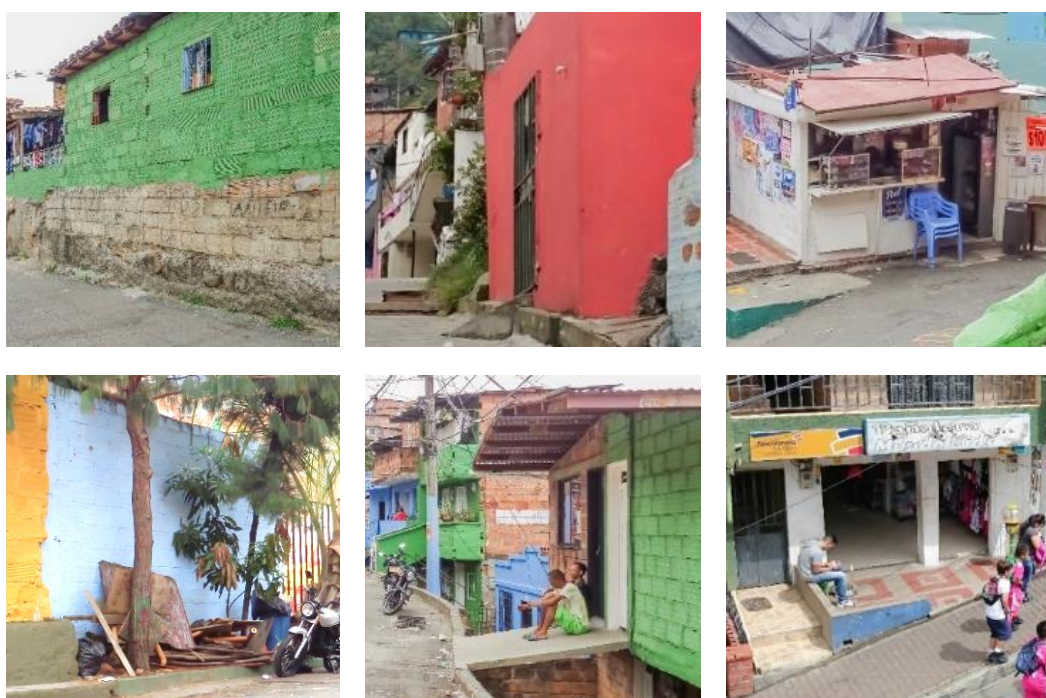
Figure 6. Different types of public/private interfaces based on Kamalipour [13]: impermeable ( left ); accessible ( middle ); porous ( right ).

The public/private urban interfaces vary along the laneways. Based on a typology of public/private interface in the context of informal settlements using the criteria of connectivity and proximity to the public space [13], most of the public/private interfaces in the study area can be considered as setbacks. There are also several impermeable and connected public/private interfaces. The impermeable interfaces are generally found at the ground level of corner buildings with blank walls (Figure 6, left). The public/private interfaces connected to the public space can be found at the ground level of residential units accessible from the public realm (Figure 6, middle). The porous public/private interfaces are not common within the settlement. An example of this type can only be found in some of the existing shops at the ground level (Figure 6, right). The setback condition works as a socio-spatial threshold accommodating loose parts and a diverse range of temporary activities, including storing, drying clothes, and parking vehicles, to name a few. A somewhat similar condition can also be found in some parts of the city where buildings incorporate a setback from the public space.