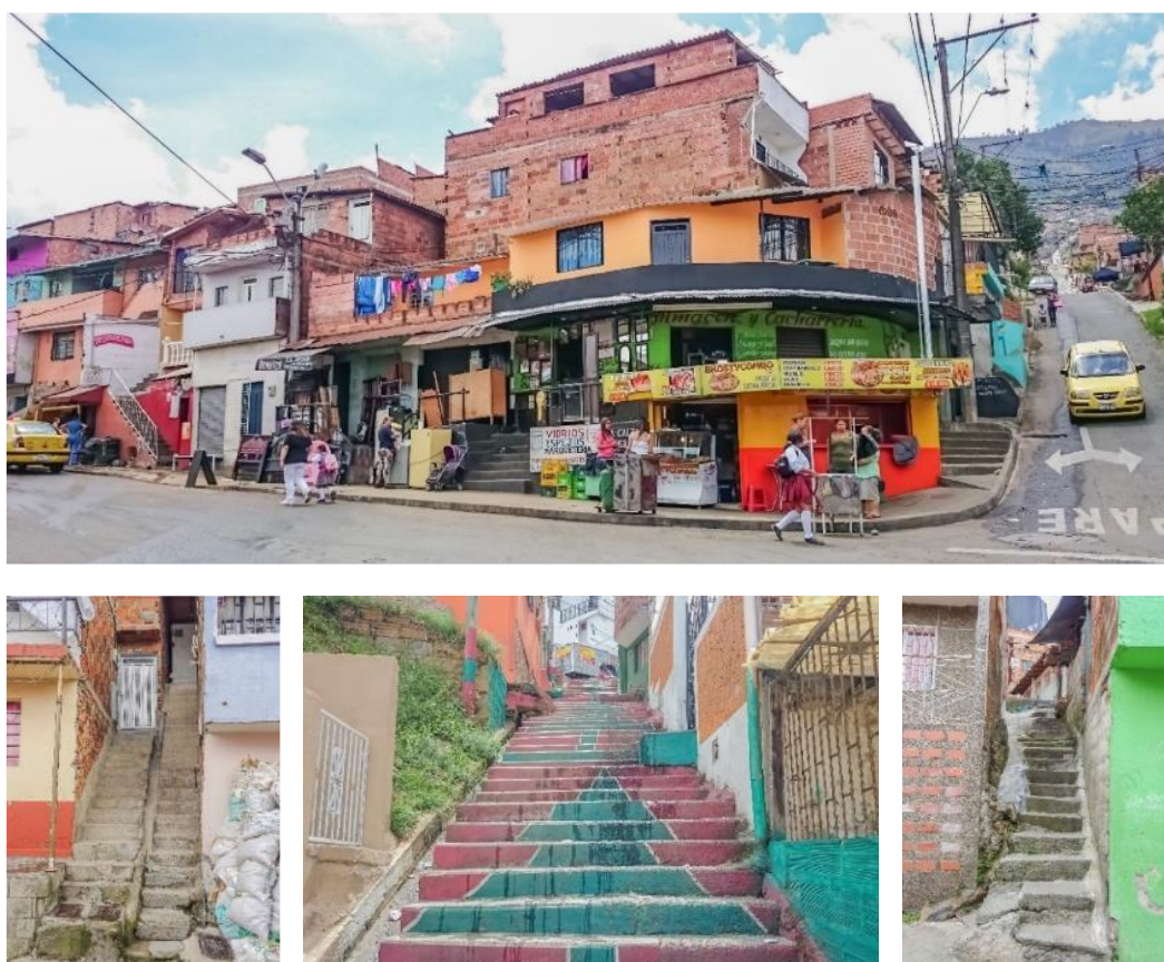
Figure 4. Lateral streets are often busier than the uphill ones ( top ); the pedestrian-only parts of the access network, including dead-end laneways ( lower left ), wide pedestrian-only laneways connecting streets ( lower middle ), and narrow walk-up laneways ( lower right ).

The study area is primarily residential, with several shops located in different parts of the settlement. Most of the shops are located along the lateral laneways where movement flows are usually more than the other parts of the settlement. The functional mix is mostly vertical in the buildings accommodating a mix of visit and live. The buildings located along the main streets consist of a ground-level shop and 1-2 upper-floor residential levels (Figure 5, middle). This is a particular form of vertical mix, which provides a socio-spatial possibility for enabling a direct connection between what can be considered as private and public territories through the ground-level shops as well as surveillance from the upper-floor residential. The steep topography along the uphill streets has given rise to another variation, which includes a vertical mix of a first-floor shop, a residential unit at the ground level, and another residential unit on the second floor (Figure 5, middle). This enables somewhat convenient access to the residential unit located on the ground floor and more visibility for the shop located on the first floor.