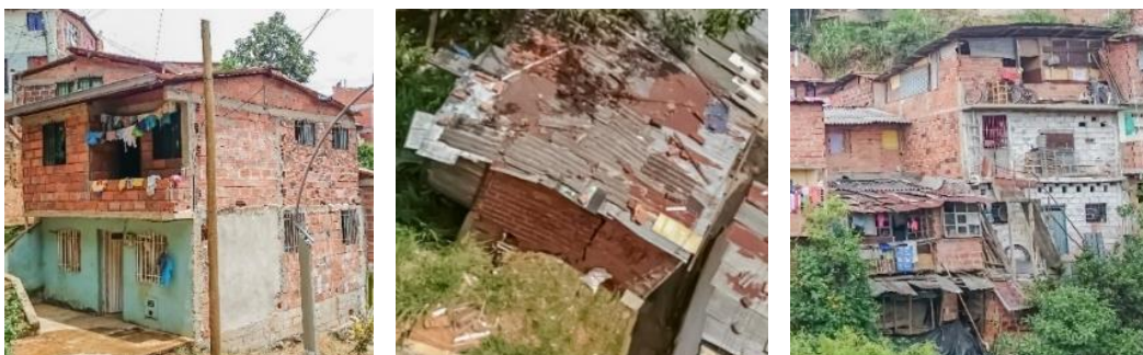
Figure 8. Construction materials: a building with temporary materials next to a building with a vertical mix of temporary and permanent materials ( right ); an informal structure with temporary materials along a creek ( middle ); a house with durable construction materials ( left ).