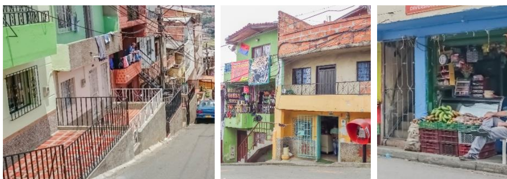
Figure 5. Fenced-off buildings in relation to public space ( left ); a vertical mix including residential units and shops ( middle ); an upper-floor residential unit with an internal staircase ( right ).

The public/private urban interfaces vary along the laneways. Based on a typology of public/private interface in the context of informal settlements using the criteria of connectivity and proximity to the public space [13], most of the public/private interfaces in the study area can be considered as setbacks. There are also several impermeable and connected public/private interfaces. The impermeable interfaces are generally found at the ground level of corner buildings with blank walls (Figure 6, left). The public/private interfaces connected to the public space can be found at the ground level of residential units accessible from the public realm (Figure 6, middle). The porous public/private interfaces are not common within the settlement. An example of this type can only be found in some of the existing shops at the ground level (Figure 6, right). The setback condition works as a socio-spatial threshold accommodating loose parts and a diverse range of temporary activities, including storing, drying clothes, and parking vehicles, to name a few. A somewhat similar condition can also be found in some parts of the city where buildings incorporate a setback from the public space.