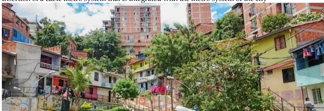
Insertion of apartment blocks along a linear open space surrounded by the painted houses