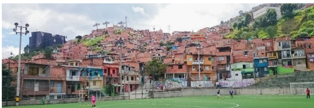
Insertion of public facilities in different parts of the area