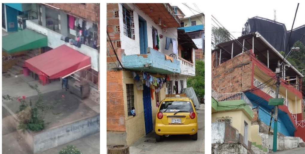
Figure 10. Extending the existing structures by adding a roof terrace (right), a balcony (middle), or a veranda (left).