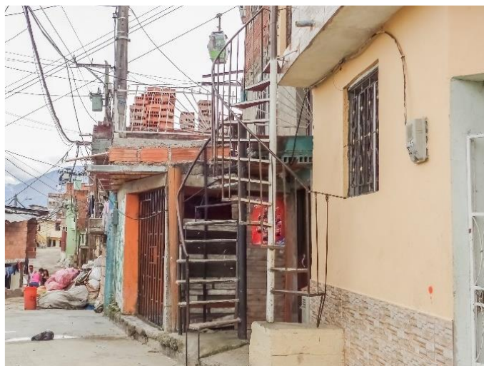
Figure 11. Dividing units by adding external staircases.

Adding external staircases is another increment of change, which may take place without adding multiple rooms to the existing buildings. This increment takes place where a single-unit building is divided into more than one unit with separate points of entry. This is an attempt to use the already available resources to generate more income, often through renting. A key investment here is to provide an external staircase and a separate entrance (Figure 11).