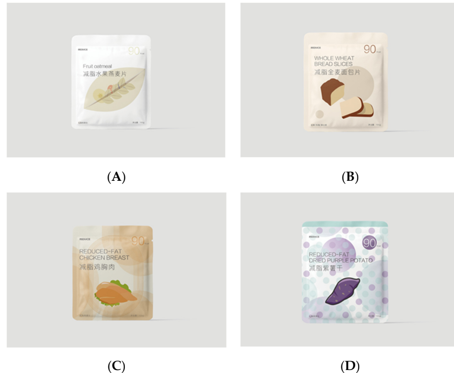
Figure 2. Product packaging under different conditions, (A,B) representing simple packaging and (C,D) representing complex packaging.

make a significant difference between the simple and complex packaging, considering that the simple packaging had significantly fewer graphics than the complex packaging and that the complex packaging had more detail.