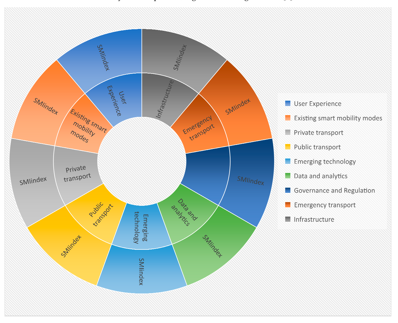
Figure 1. Structure of the smart mobility evaluation framework.

mobility and ITS solutions depends largely on an all-inclusive regulatory framework that outlines the responsibilities of all the stakeholders, including the public and private sectors, and the R&D community in ITS development and operation. Furthermore, regulations integrate current and emerging technologies seamlessly. In the Asia-Pacific region, the successes of Japan, Singapore, and South Korea in the planning, development, and operation of smart mobility could largely be attributed to the well-developed and adequate smart mobility and ITS policies, regulations, and guidelines [6].