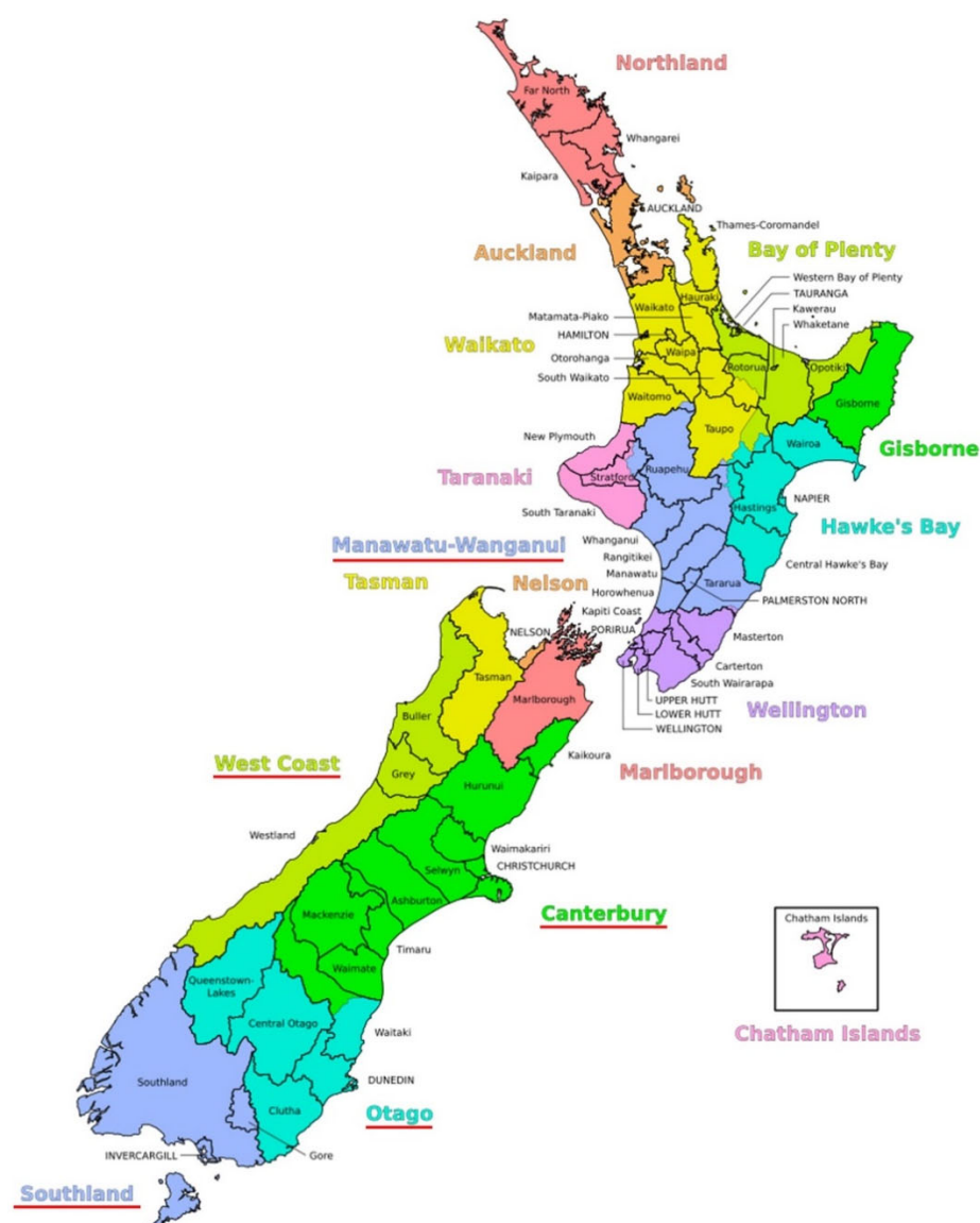
Figure 1. NZ Regional Councils and Territorial Authorities (adapted from Creative Commons).