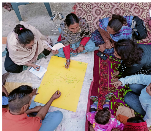
Figure 2. Mapping a village and its waste.